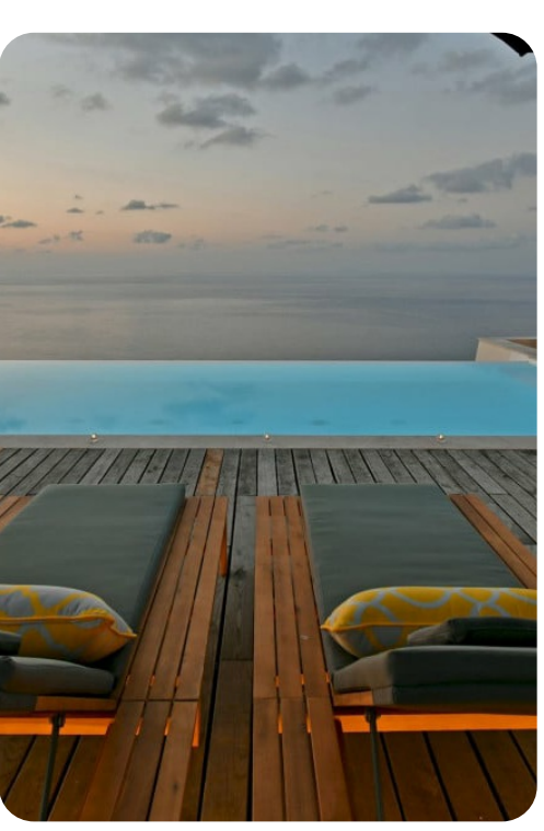
Villa Luna | Page 6 of 8