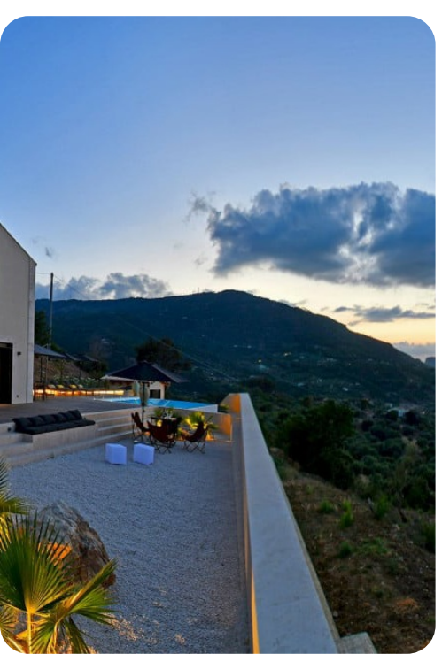
Villa Luna | Page 7 of 8