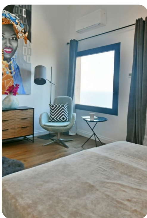
Villa Luna | Page 3 of 8