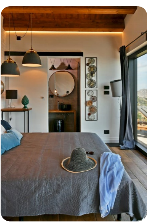
Villa Luna | Page 4 of 8