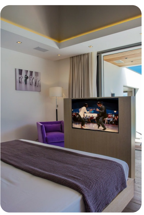
Villa Loukoko | Page 6 of 8