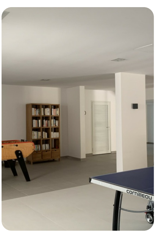
Villa Loukoko | Page 4 of 8