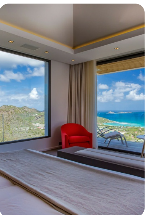
Villa Loukoko | Page 7 of 8