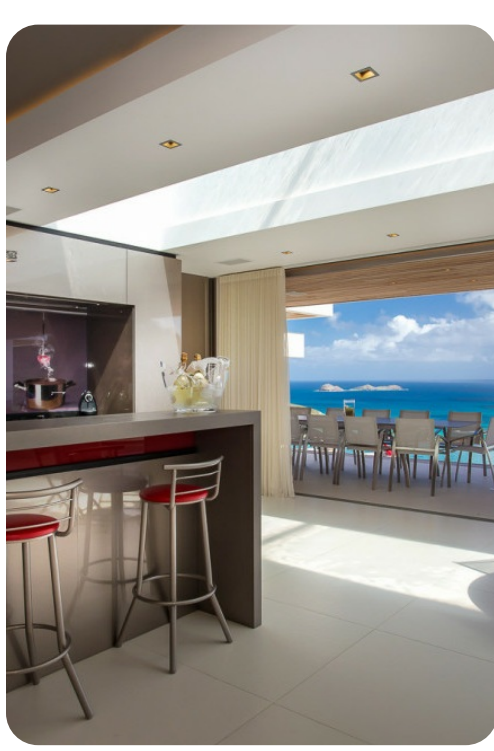
Villa Loukoko | Page 3 of 8