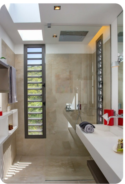
Villa Loukoko | Page 5 of 8