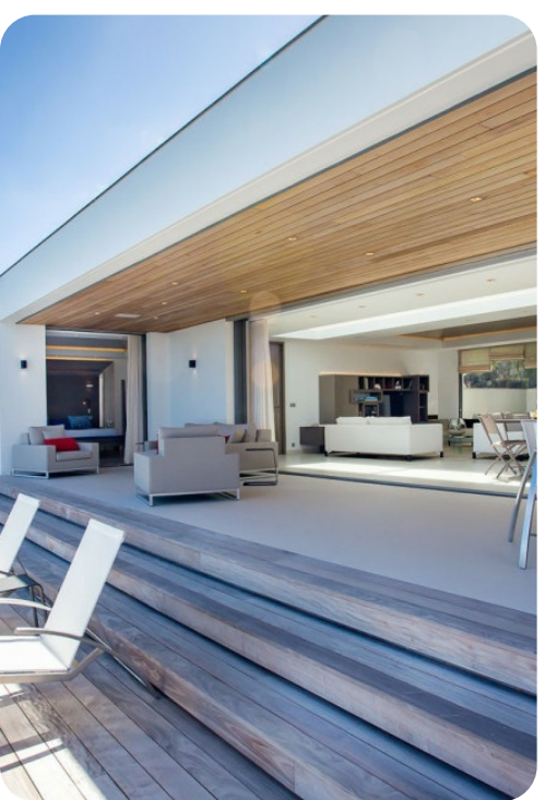
Villa Loukoko | Page 8 of 8