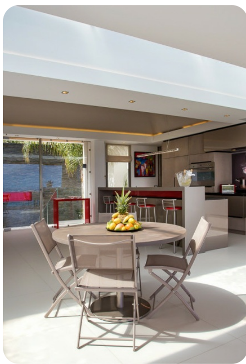
Villa Loukoko | Page 2 of 8