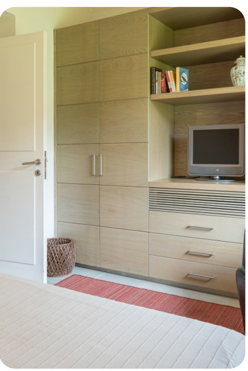
Villa Le Fontane | Page 6 of 8