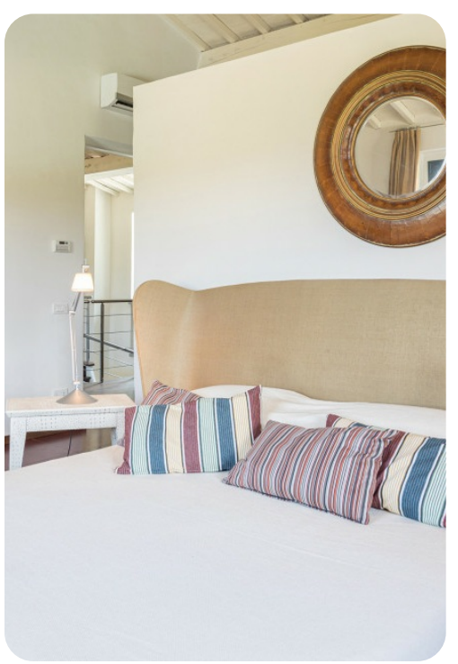
Villa Le Fontane | Page 5 of 8