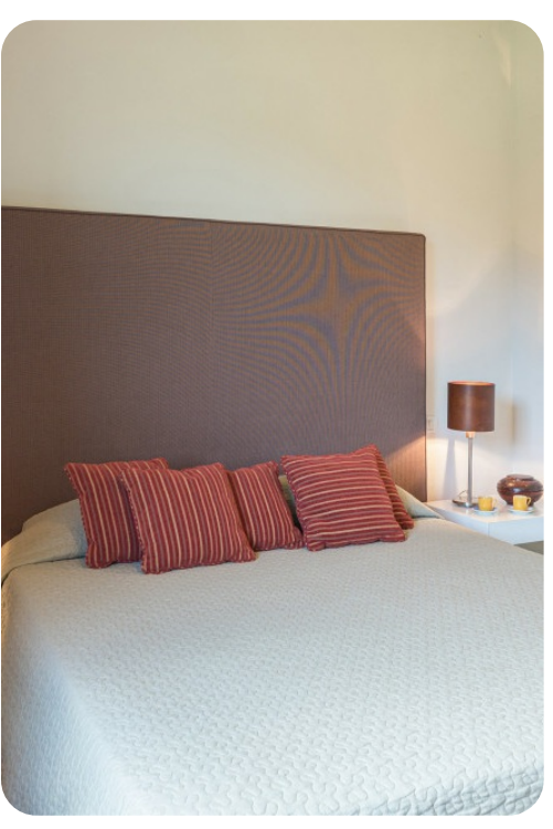
Villa Le Fontane | Page 7 of 8