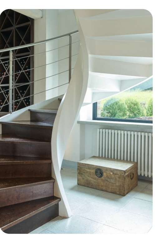
Villa Le Fontane | Page 4 of 8