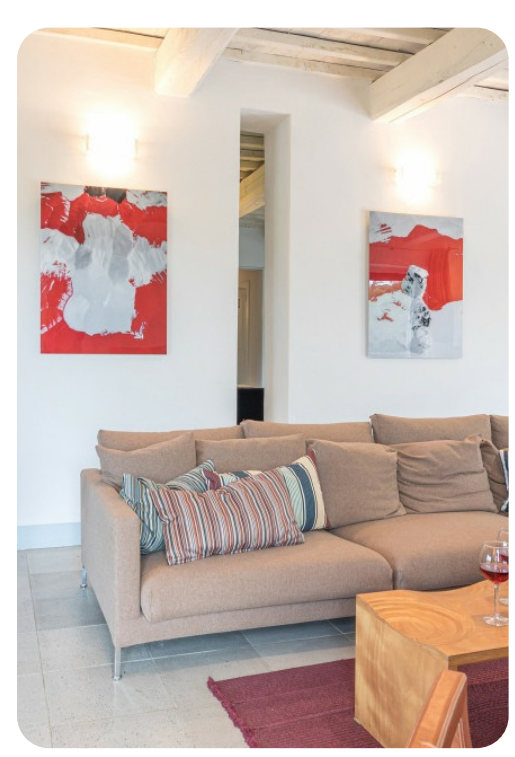
Villa Le Fontane | Page 3 of 8