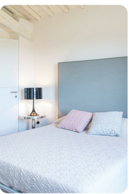
Villa Le Fontane | Page 8 of 8