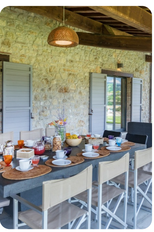
Villa Le Fontane | Page 2 of 8