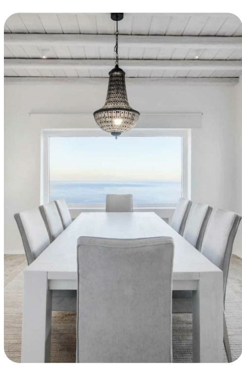
Villa Lazaros | Page 2 of 8