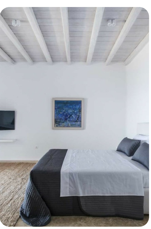
Villa Lazaros | Page 4 of 8