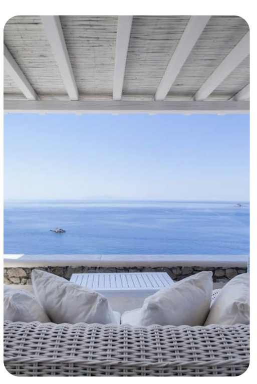
Villa Lazaros | Page 8 of 8