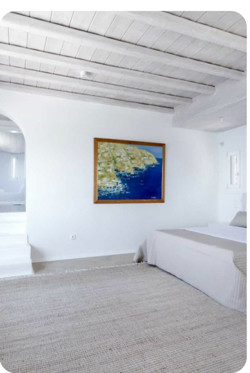
Villa Lazaros | Page 6 of 8