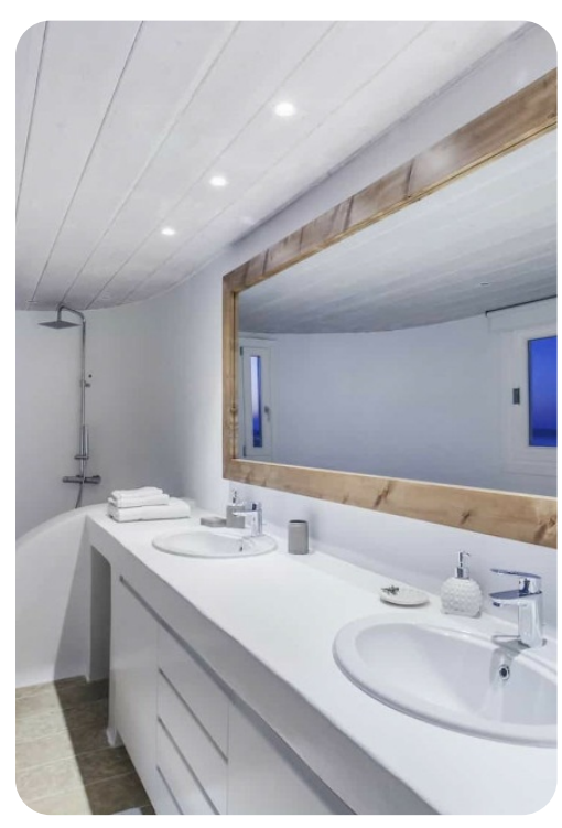
Villa Lazaros | Page 3 of 8