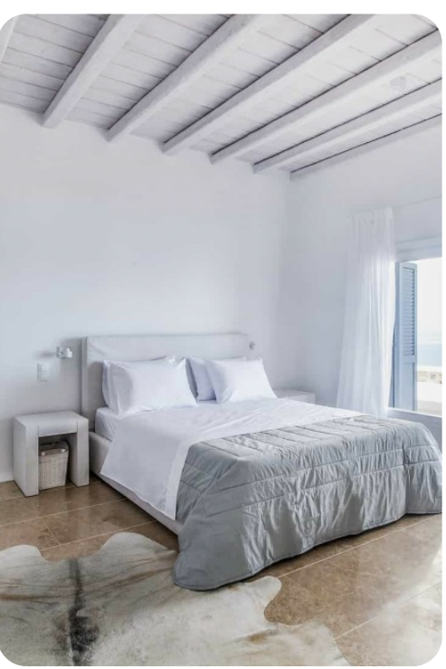
Villa Lazaros | Page 5 of 8