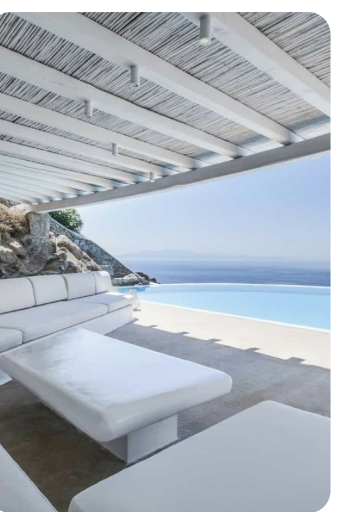
Villa Lazaros | Page 7 of 8