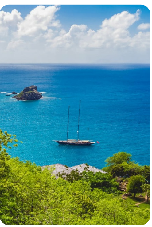
Villa L'Enclos | Page 6 of 7