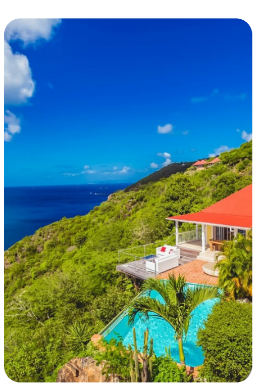
Villa L'Enclos | Page 5 of 7