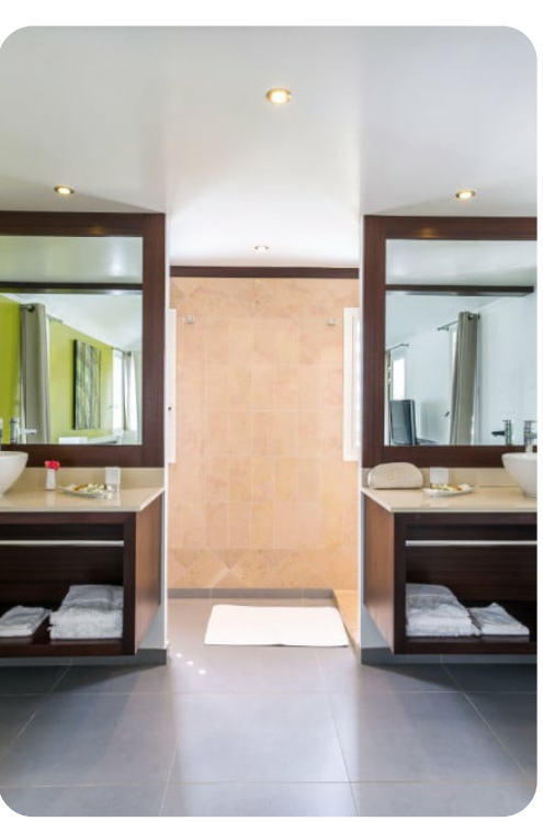
Villa L'Enclos | Page 3 of 7