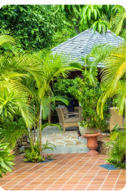
Villa L'Enclos | Page 4 of 7