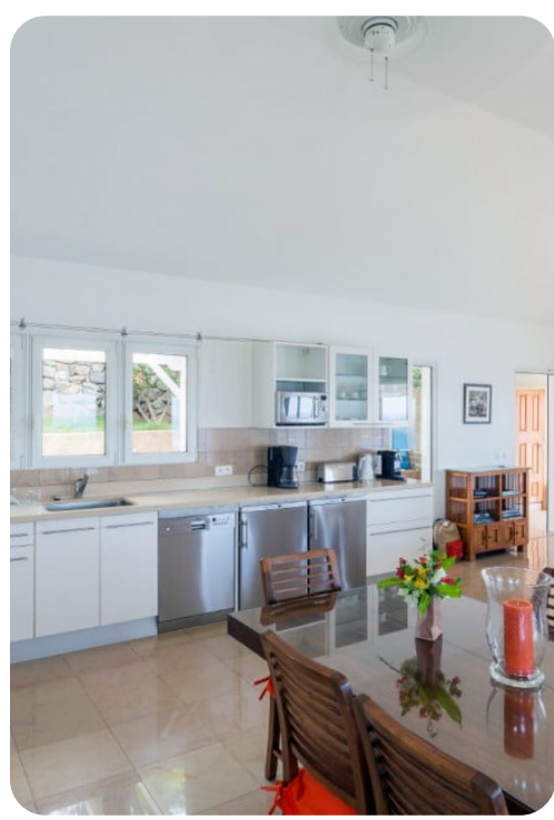
Villa L'Enclos | Page 2 of 7