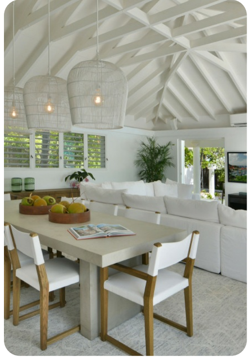
Villa Kumara | Page 2 of 8