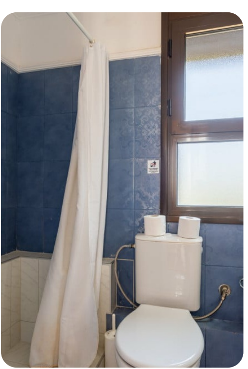
Villa Kefalas | Page 6 of 8