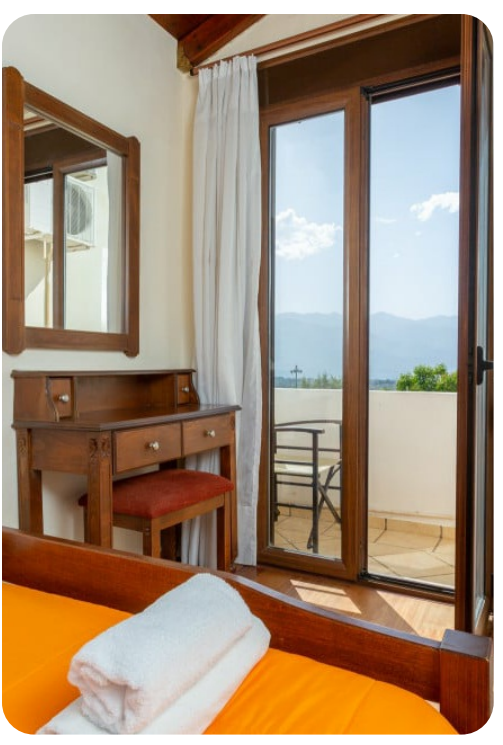
Villa Kefalas | Page 4 of 8