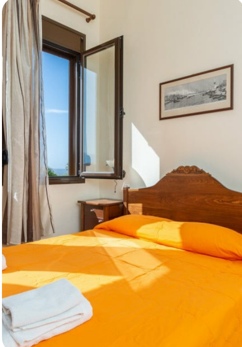
Villa Kefalas | Page 3 of 8