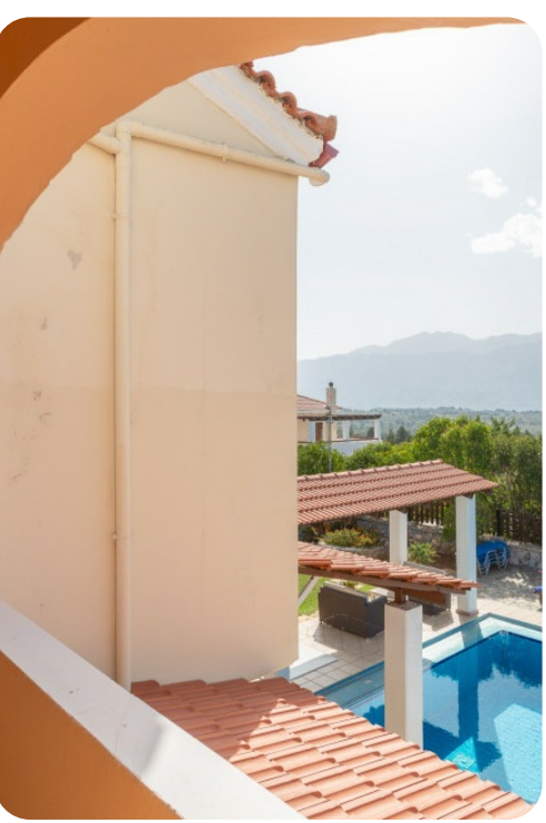
Villa Kefalas | Page 5 of 8