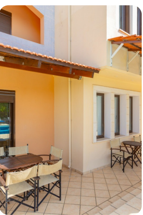
Villa Kefalas | Page 7 of 8