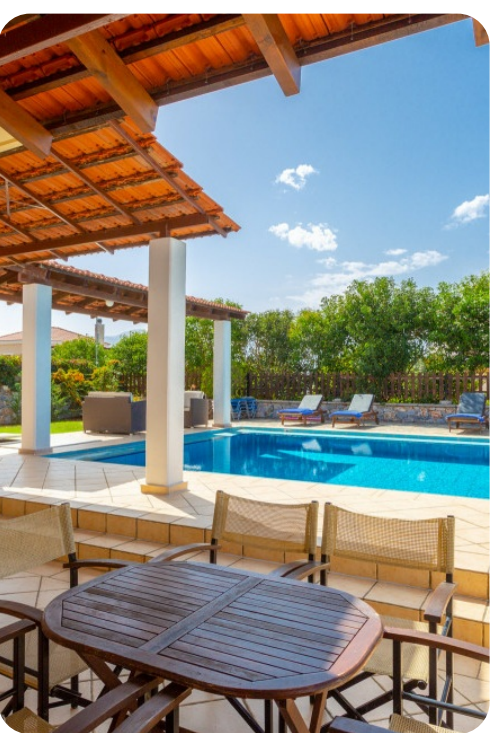
Villa Kefalas | Page 8 of 8