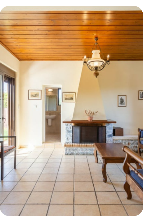
Villa Kefalas | Page 2 of 8