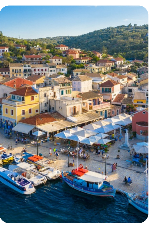
Villa Katerina - Paxos | Page 5 of 7