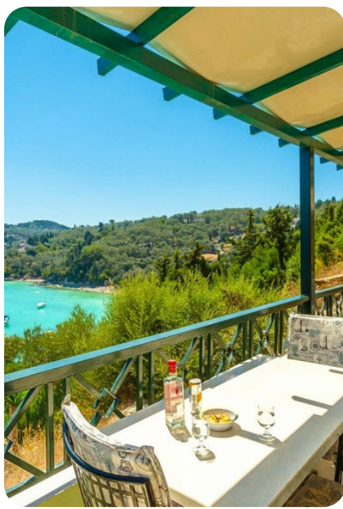
Villa Katerina - Paxos | Page 3 of 7