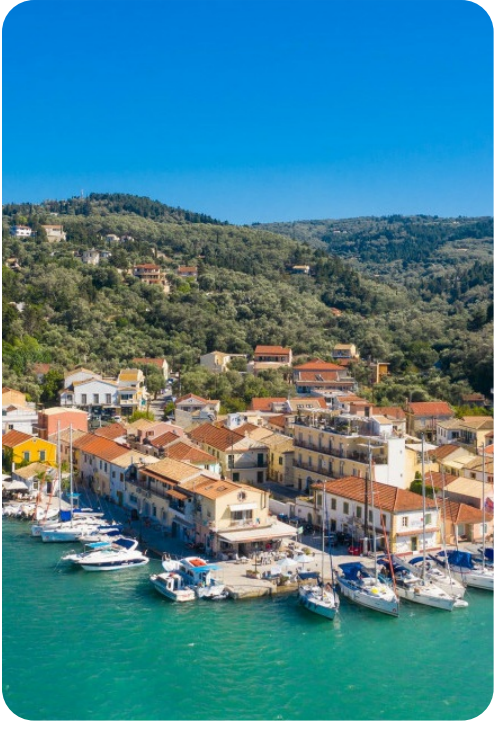
Villa Katerina - Paxos | Page 4 of 7