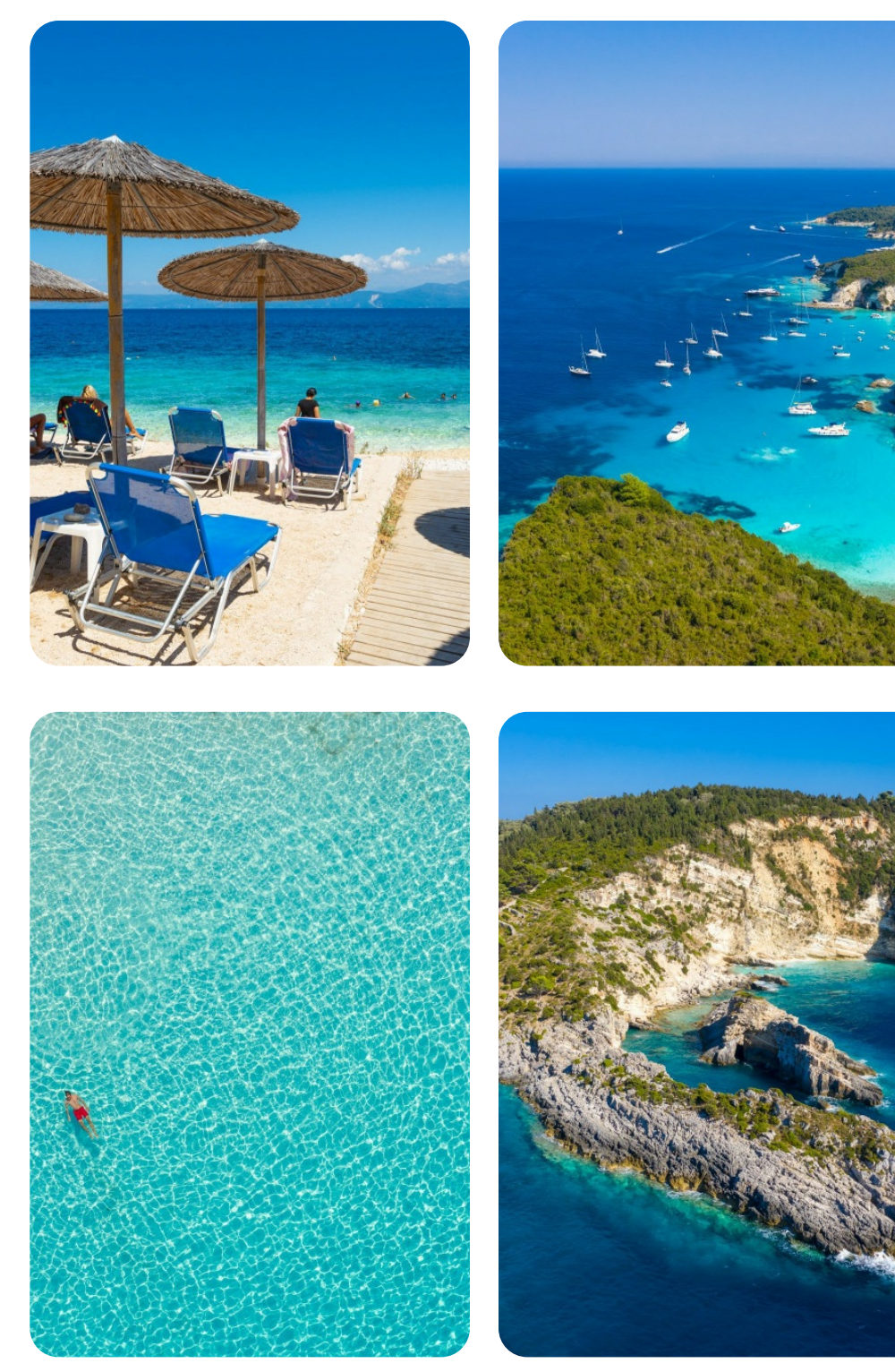
Villa Katerina - Paxos | Page 6 of 7