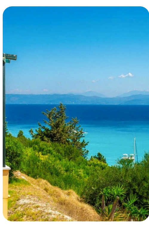
Villa Katerina - Paxos | Page 2 of 7