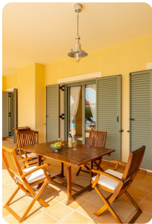
Villa Katerina - Kefalonia | Page 3 of 8