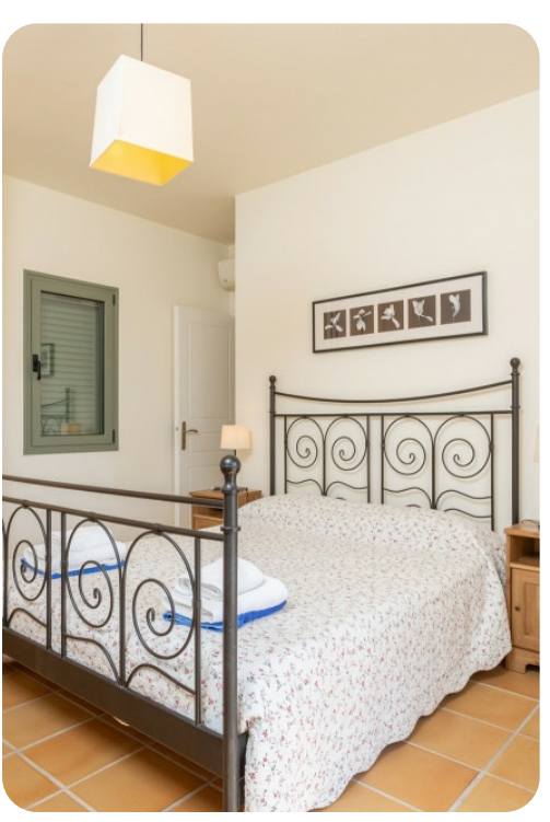
Villa Katerina - Kefalonia | Page 5 of 8