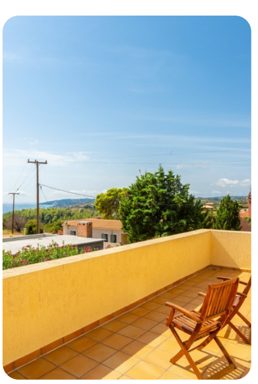
Villa Katerina - Kefalonia | Page 6 of 8