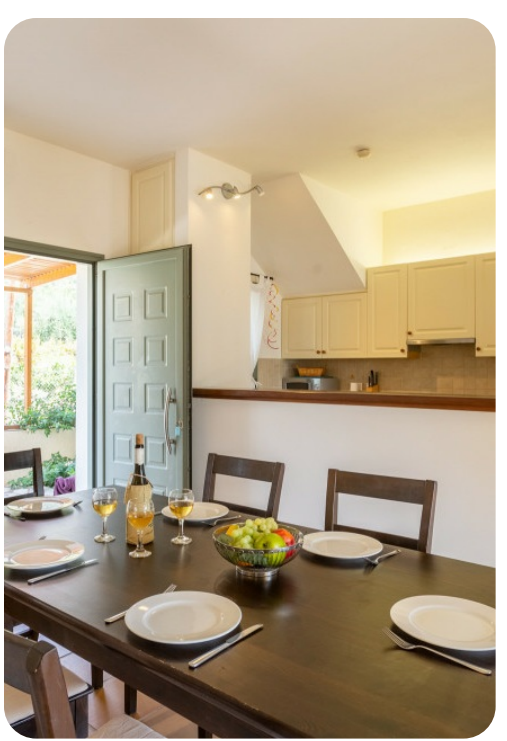
Villa Katerina - Kefalonia | Page 4 of 8