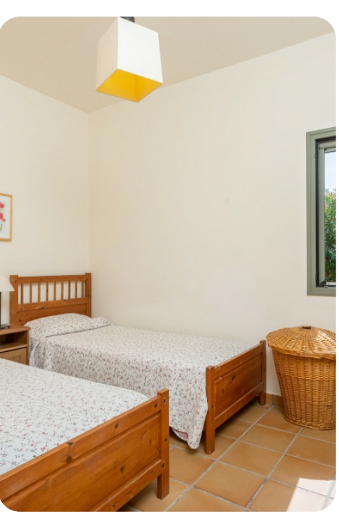
Villa Katerina - Kefalonia | Page 7 of 8