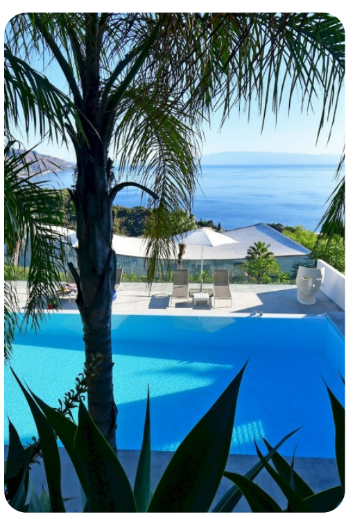
Villa Karin | Page 2 of 8