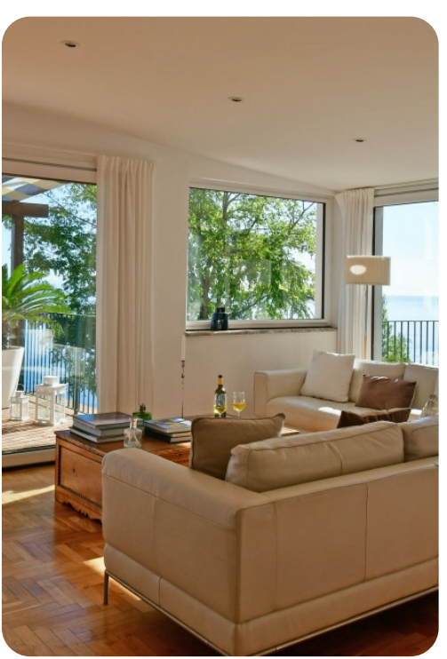
Villa Karin | Page 8 of 8