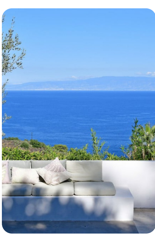
Villa Karin | Page 3 of 8