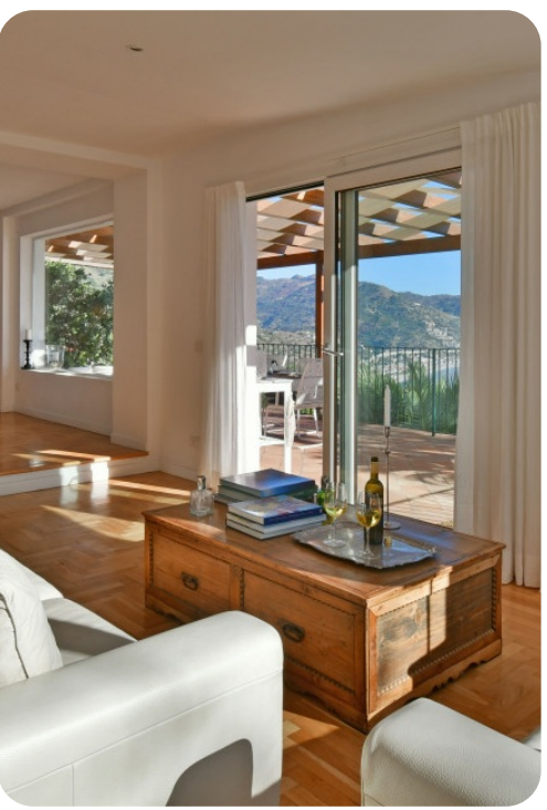
Villa Karin | Page 7 of 8