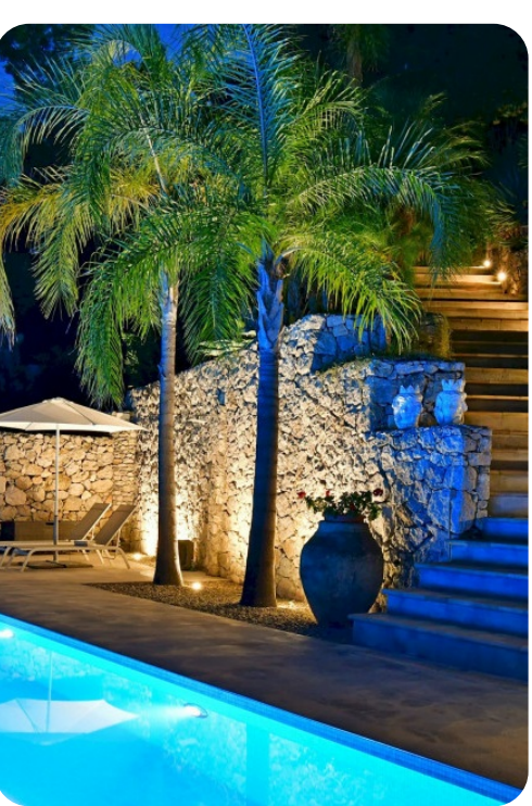
Villa Karin | Page 6 of 8