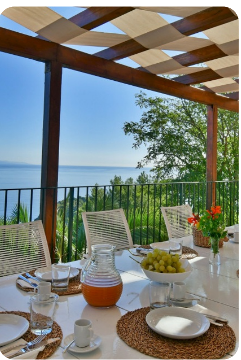
Villa Karin | Page 5 of 8