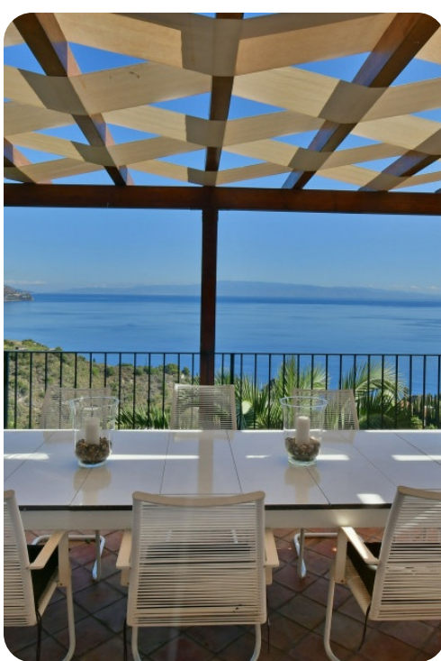
Villa Karin | Page 4 of 8