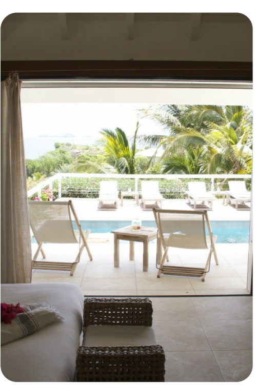
Villa Jali | Page 3 of 7