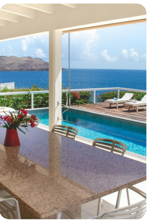
Villa Jali | Page 6 of 7