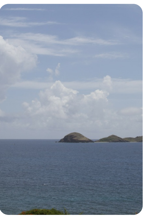
Villa Jali | Page 7 of 7