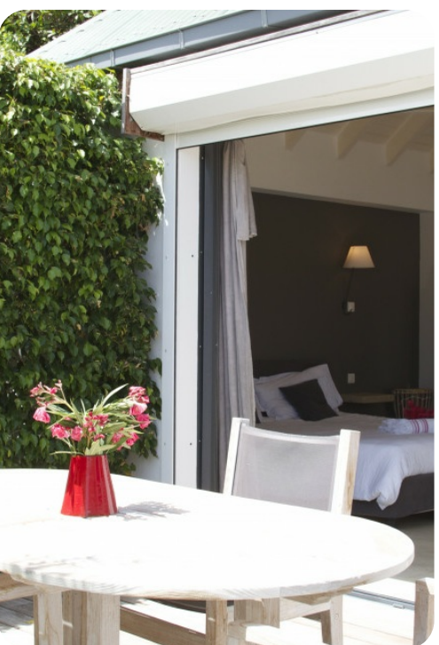
Villa Jali | Page 4 of 7