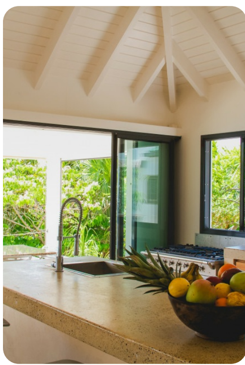
Villa Jali | Page 2 of 7