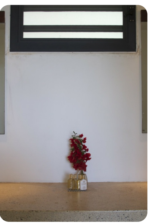
Villa Jali | Page 5 of 7