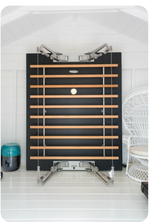
Villa Ixfalia | Page 3 of 8