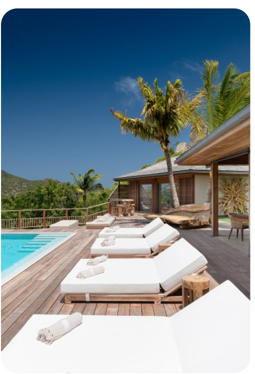
Villa Ixfalia | Page 8 of 8