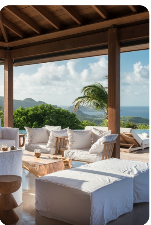
Villa Ixfalia | Page 7 of 8