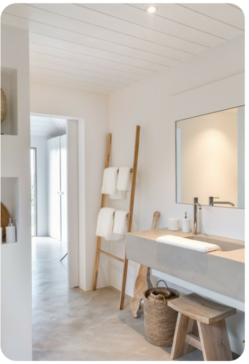
Villa Ixfalia | Page 5 of 8