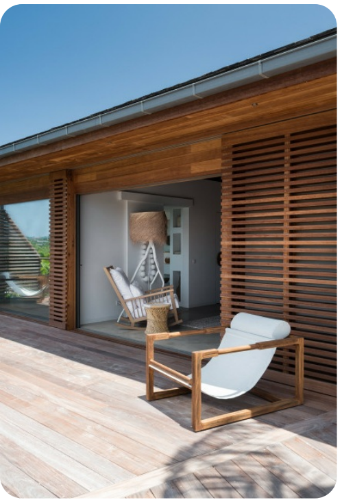
Villa Ixfalia | Page 4 of 8