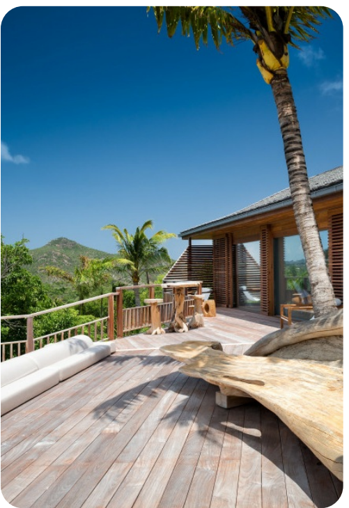
Villa Ixfalia | Page 6 of 8