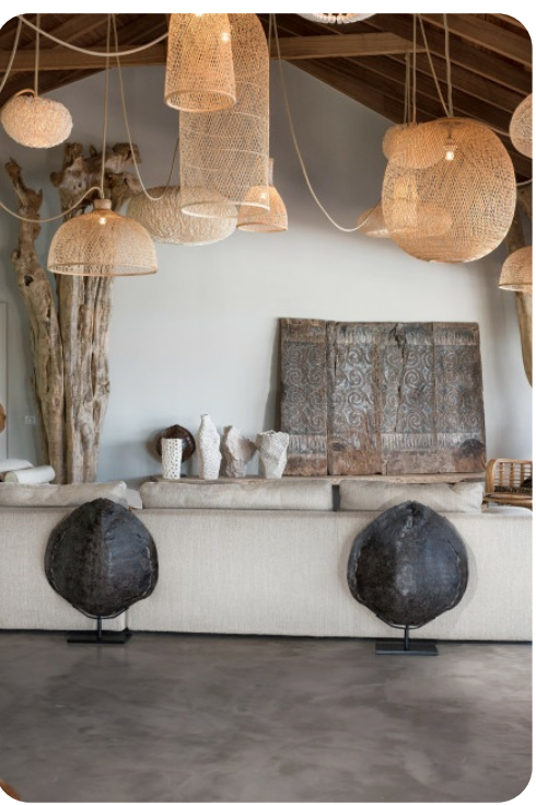
Villa Ixfalia | Page 2 of 8