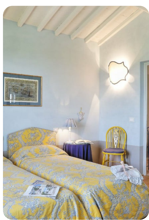
Villa II Meluccio | Page 3 of 8