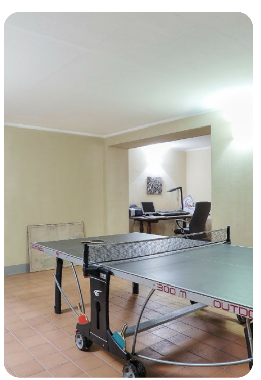
Villa II Meluccio | Page 7 of 8