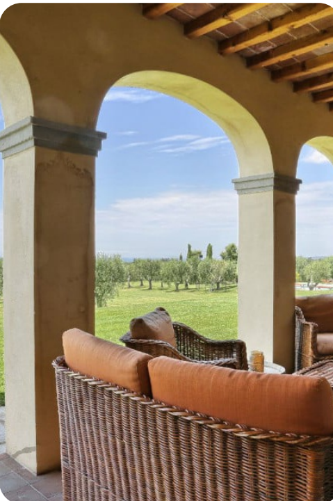
Villa II Meluccio | Page 2 of 8