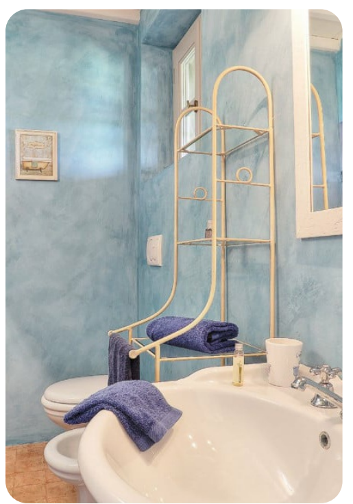
Villa II Meluccio | Page 5 of 8