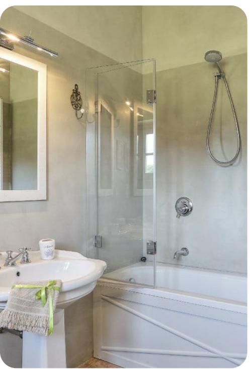
Villa II Meluccio | Page 6 of 8