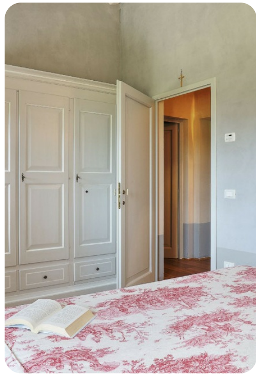
Villa II Meluccio | Page 4 of 8