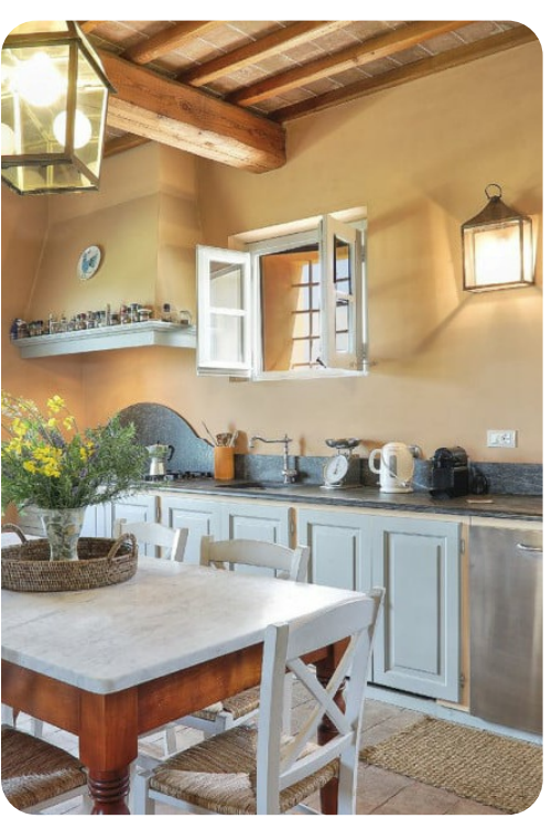
Villa II Meluccio | Page 8 of 8