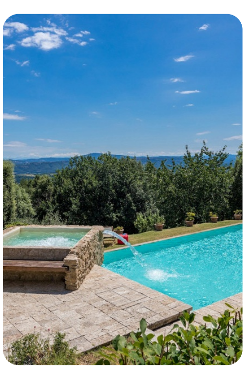
Villa II Cedro | Page 8 of 8