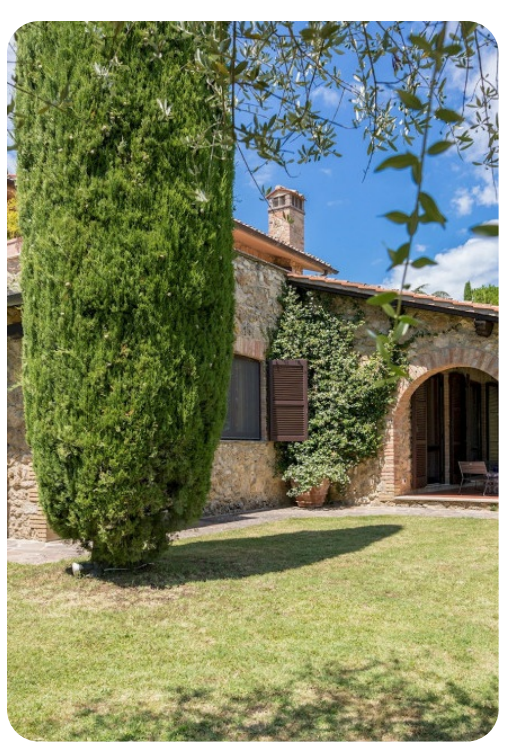
Villa Il Cedro | Page 4 of 8