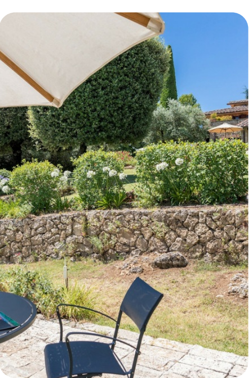
Villa II Cedro | Page 5 of 8