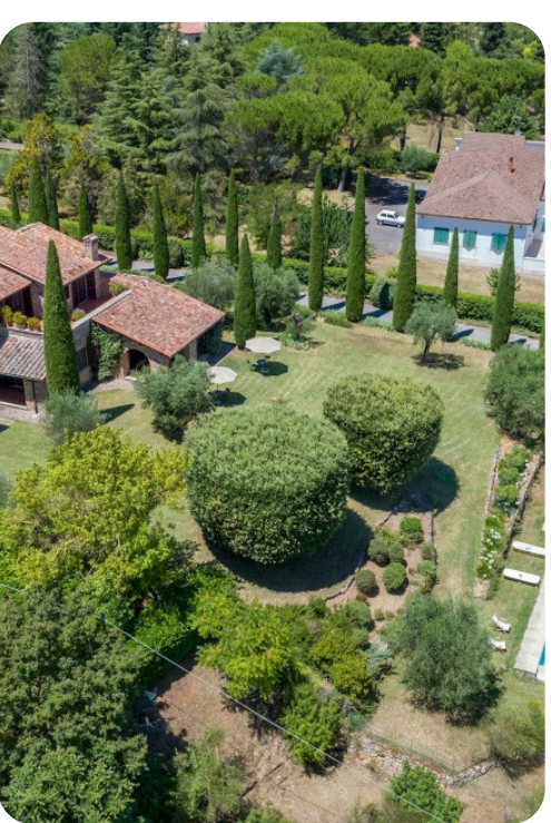
Villa II Cedro | Page 6 of 8