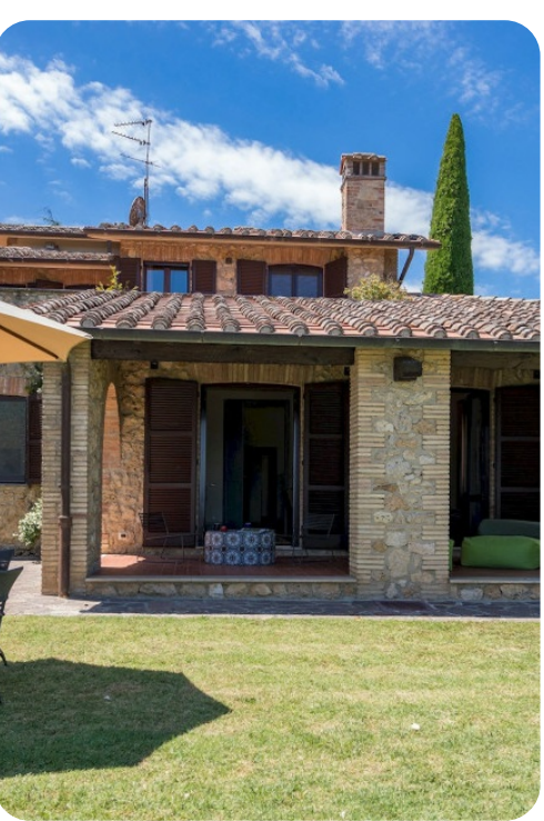
Villa II Cedro | Page 7 of 8