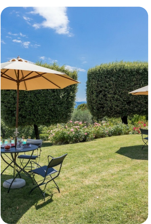
Villa Il Cedro | Page 2 of 8