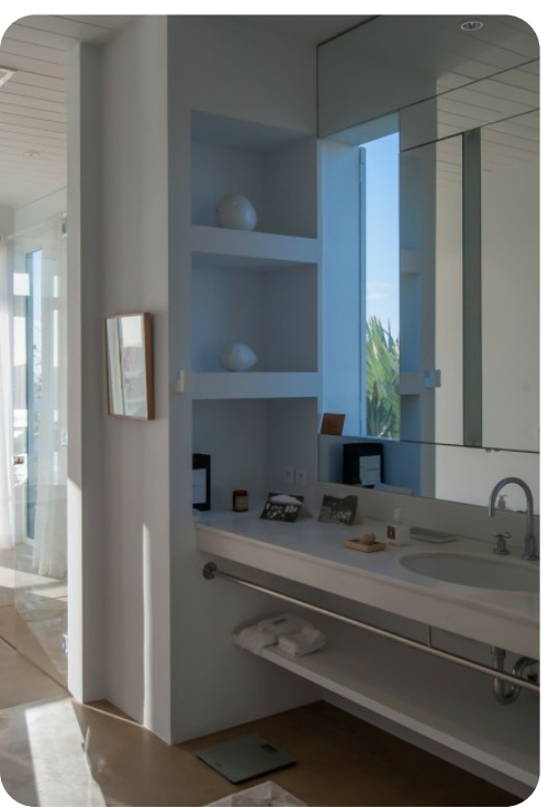
Villa Hill House | Page 5 of 8