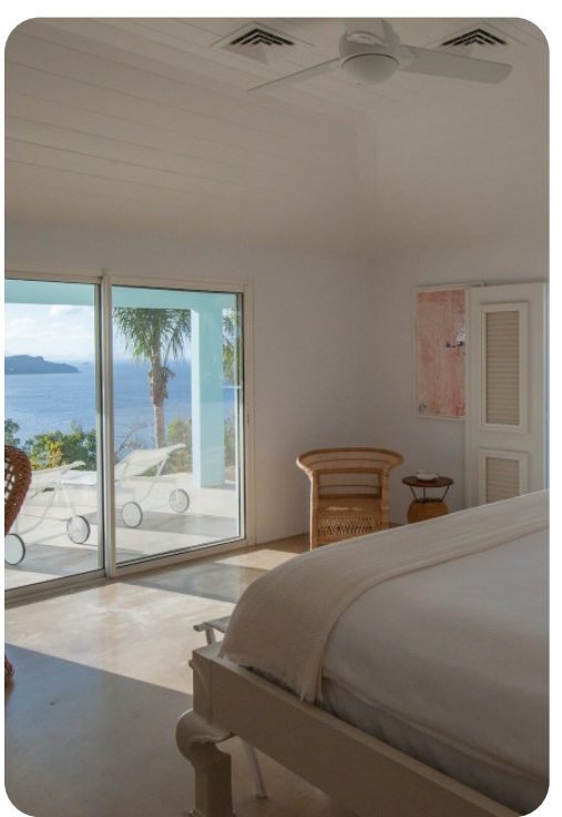
Villa Hill House | Page 8 of 8