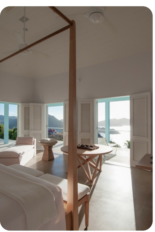
Villa Hill House | Page 4 of 8