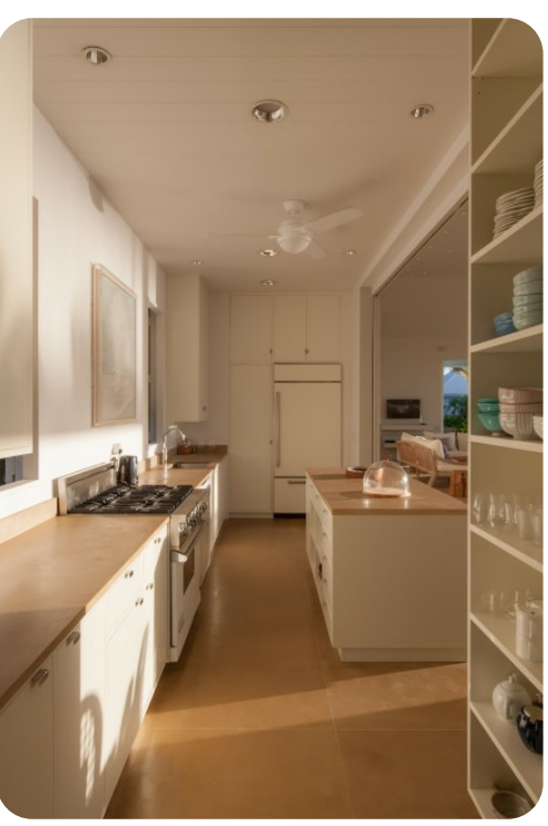
Villa Hill House | Page 2 of 8