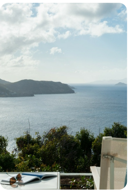
Villa Hill House | Page 6 of 8