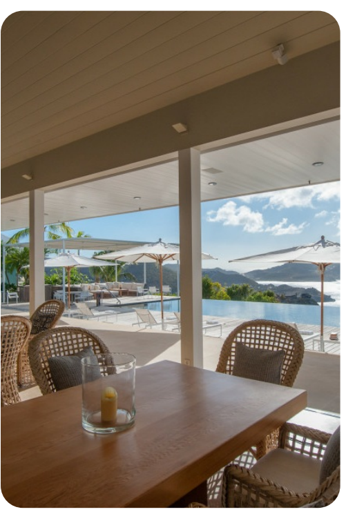
Villa Hill House | Page 3 of 8