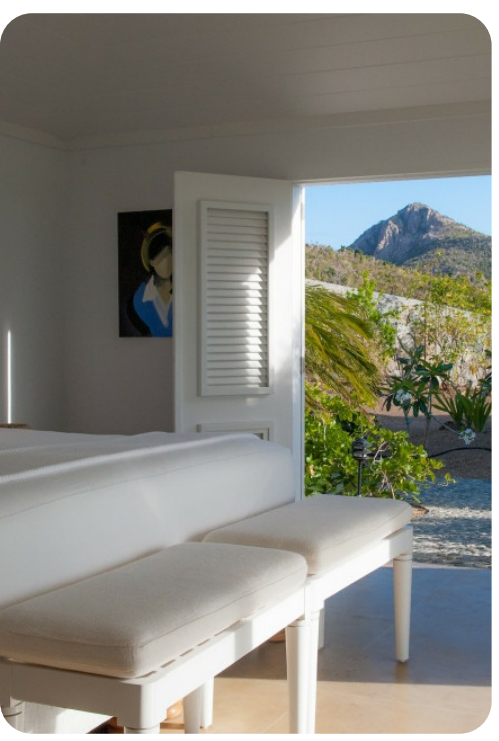
Villa Hill House | Page 7 of 8