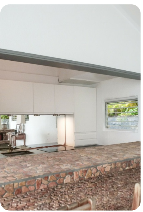
Villa Heloa | Page 2 of 5