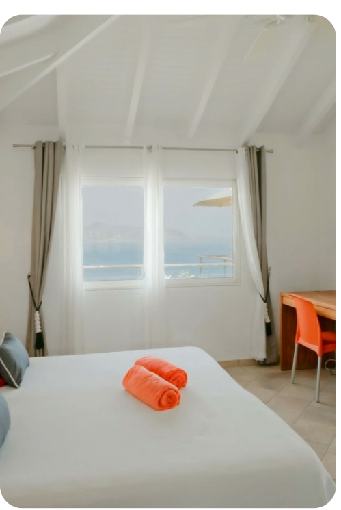
Villa Heloa | Page 3 of 5