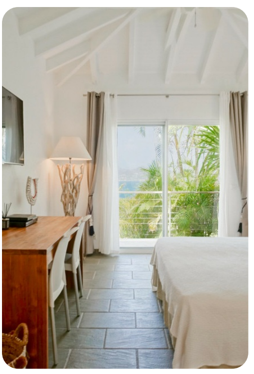
Villa Heloa | Page 4 of 5