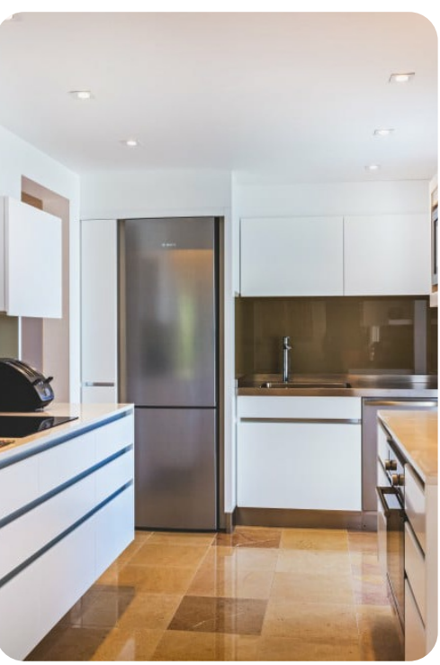
Villa Grain de Folie | Page 2 of 4