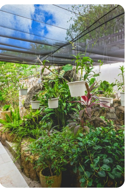
Villa Grain de Folie | Page 4 of 4