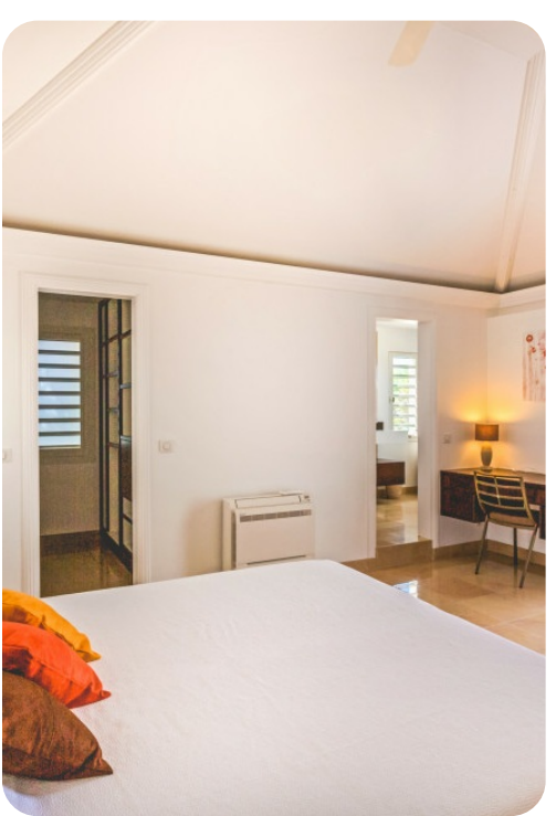
Villa Grain de Folie | Page 3 of 4