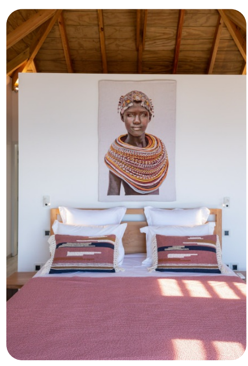
Villa Golden View | Page 3 of 5