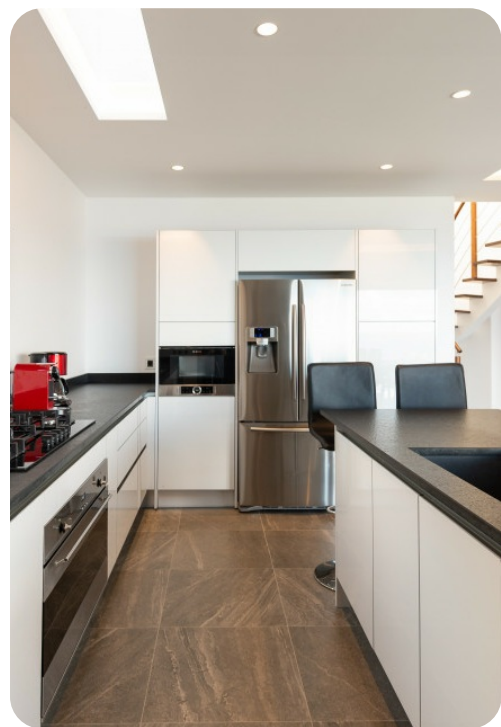
Villa Golden View | Page 2 of 5