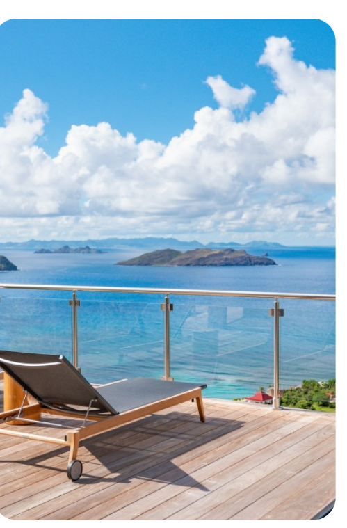
Villa Golden View | Page 4 of 5