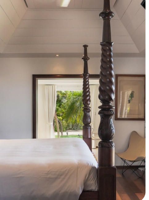
Villa Fleur de Mer | Page 3 of 8