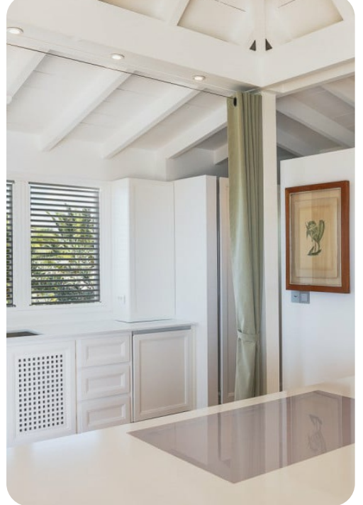
Villa Fleur de Mer | Page 2 of 8