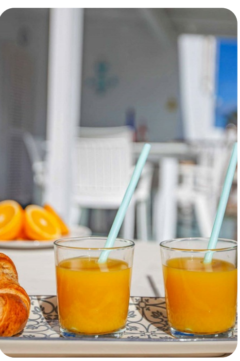
Villa Field Dreams | Page 2 of 6