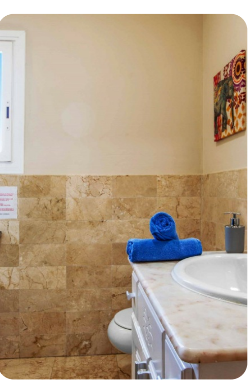
Villa Field Dreams | Page 5 of 6