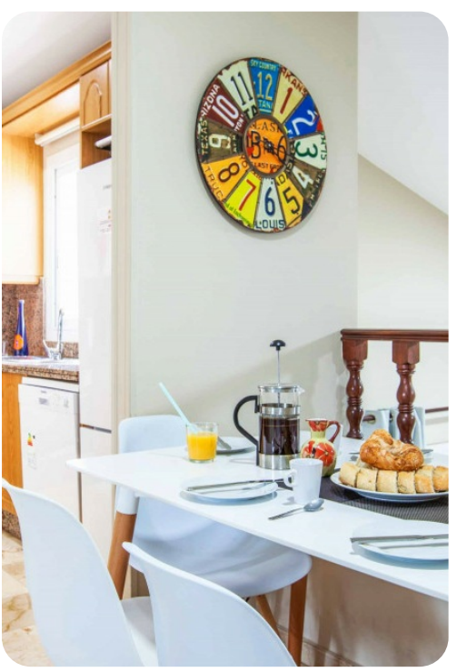
Villa Field Dreams | Page 3 of 6