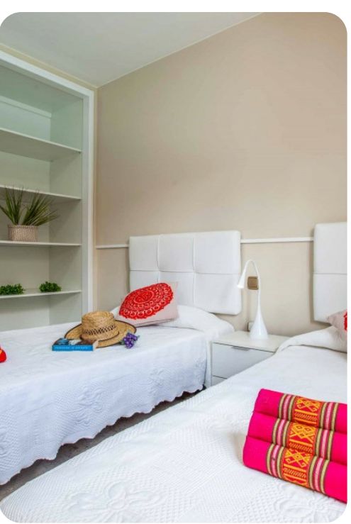
Villa Field Dreams | Page 4 of 6