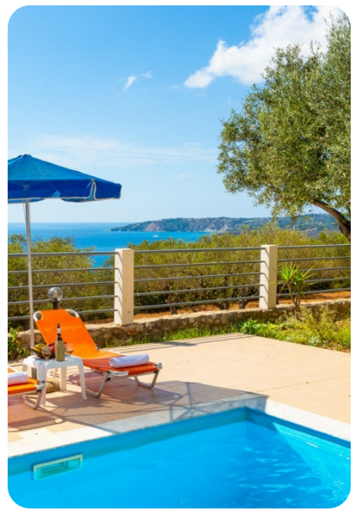
Villa Eri | Page 3 of 8