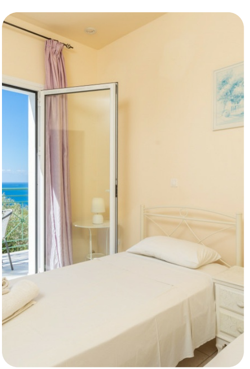
Villa Eri | Page 6 of 8