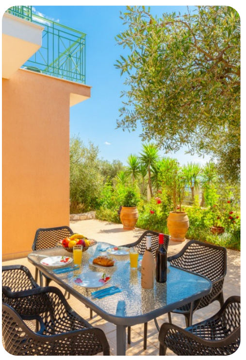
Villa Eri | Page 8 of 8