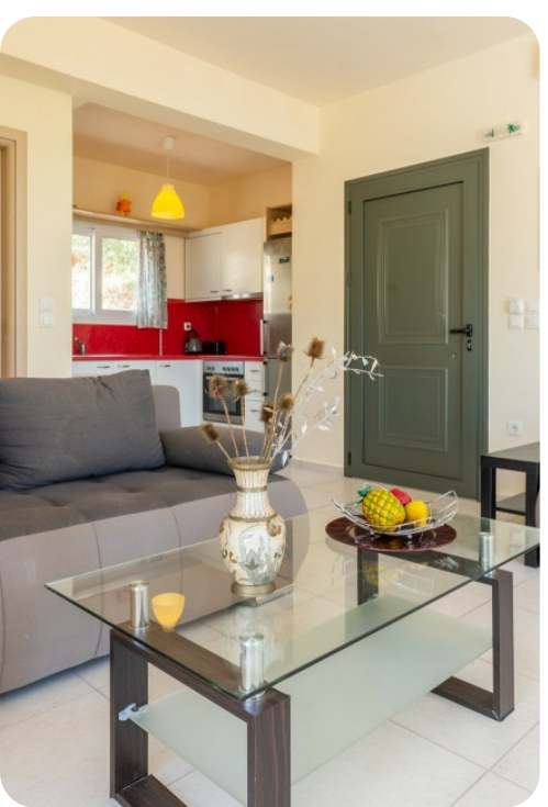
Villa Eri | Page 4 of 8