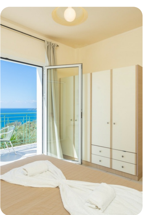
Villa Eri | Page 5 of 8