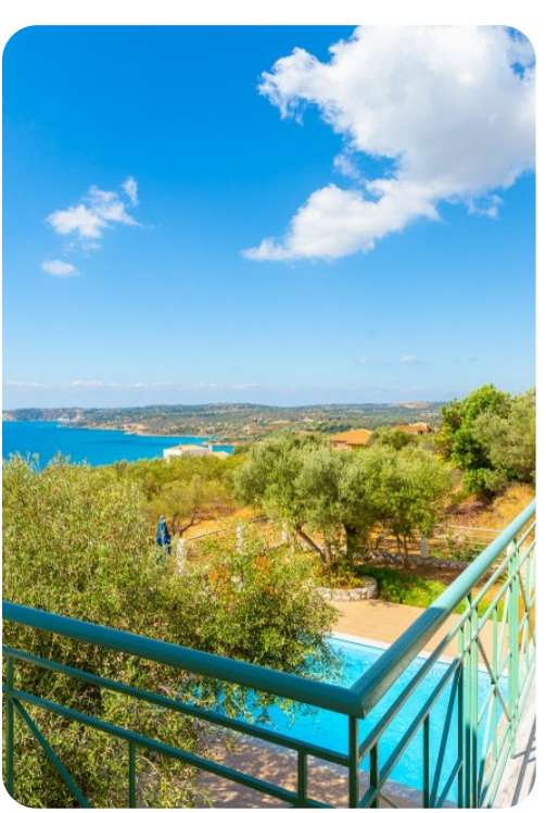
Villa Eri | Page 7 of 8