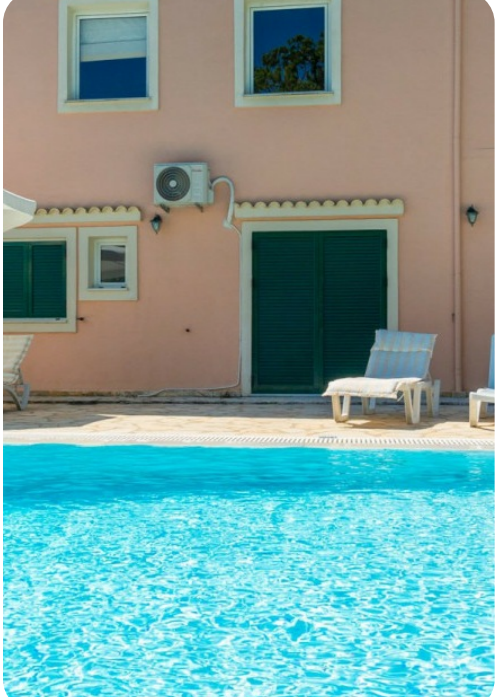
Villa Eleni - Corfu | Page 6 of 8