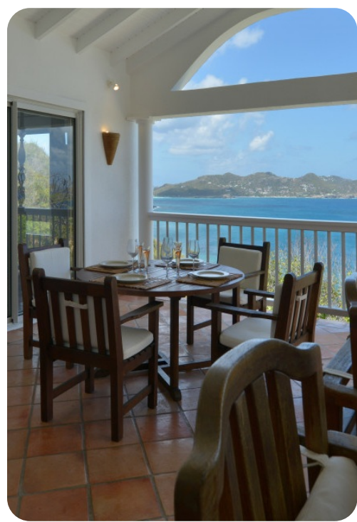
Villa Colibri Pointe Milou | Page 2 of 5