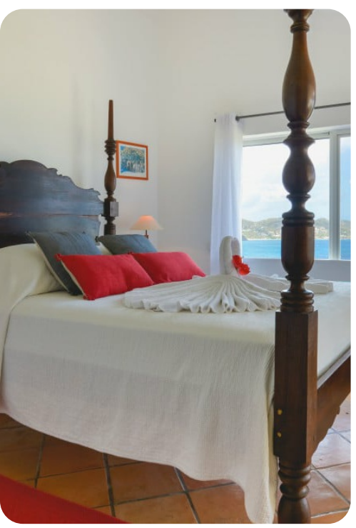
Villa Colibri Pointe Milou | Page 3 of 5