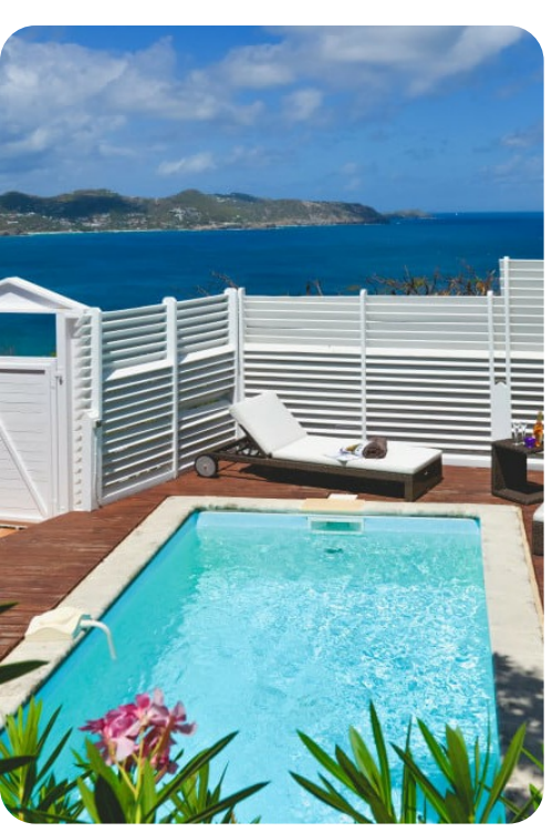
Villa Colibri Pointe Milou | Page 4 of 5