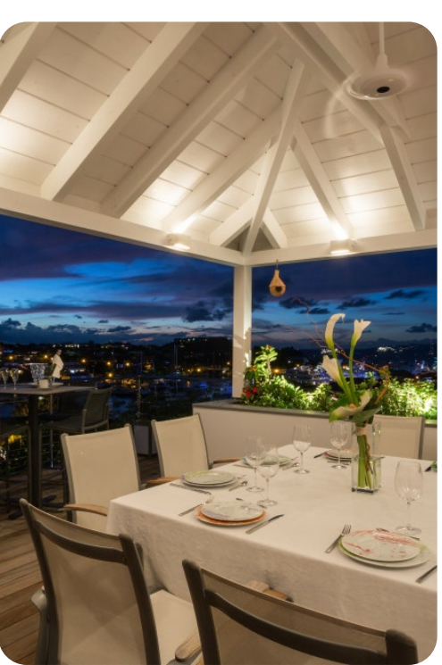
Villa Casaroc | Page 5 of 7