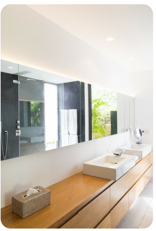
Villa Casaroc | Page 3 of 7