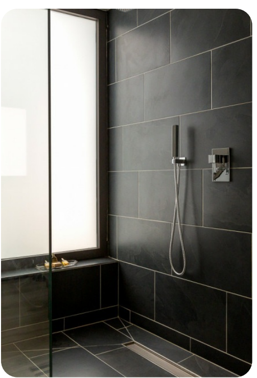
Villa Casaroc | Page 4 of 7