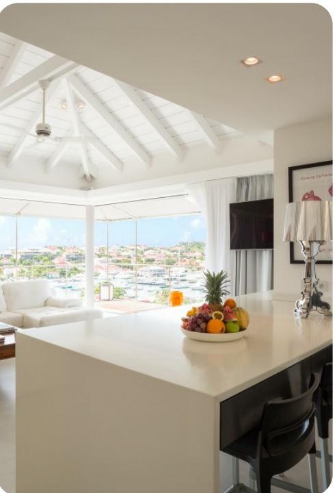
Villa Casaroc | Page 2 of 7