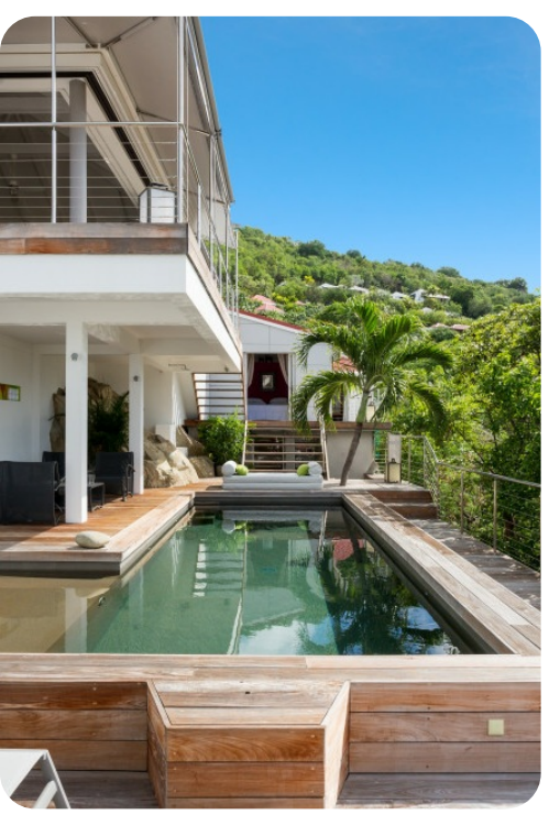
Villa Casaroc | Page 6 of 7