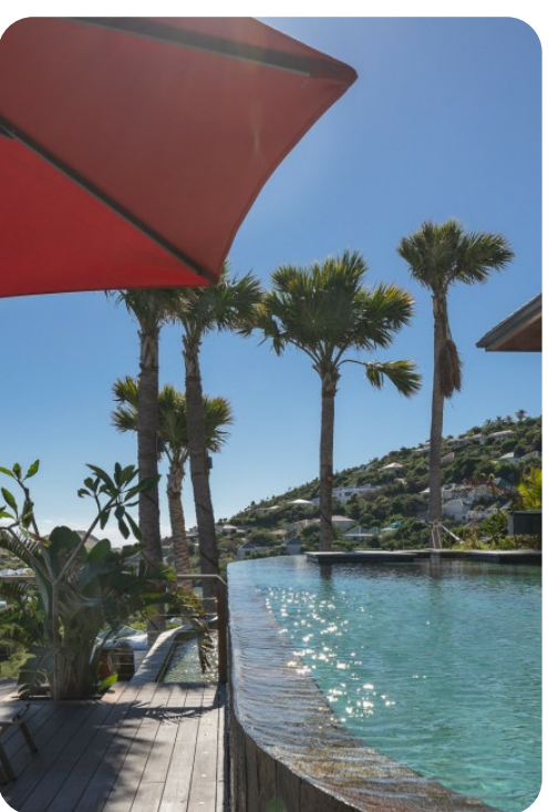
Villa Casa Pablo | Page 7 of 8