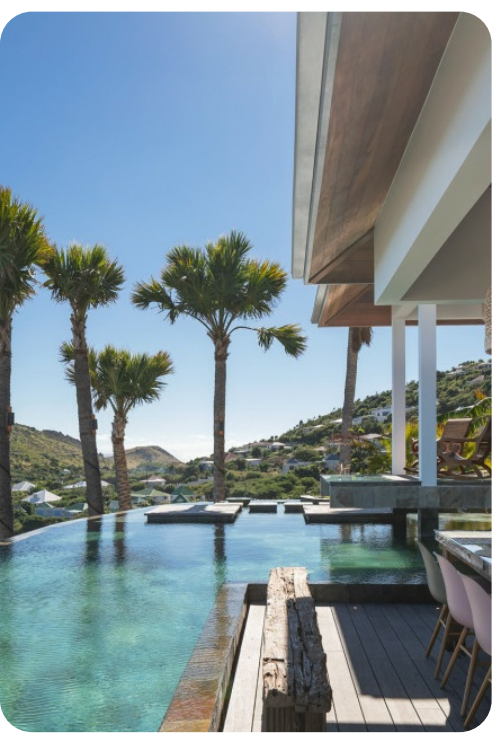
Villa Casa Pablo | Page 8 of 8