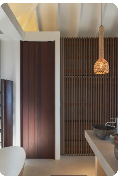
Villa Casa Pablo | Page 4 of 8