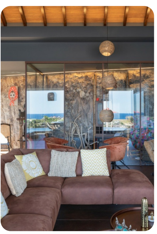
Villa Casa Pablo | Page 2 of 8