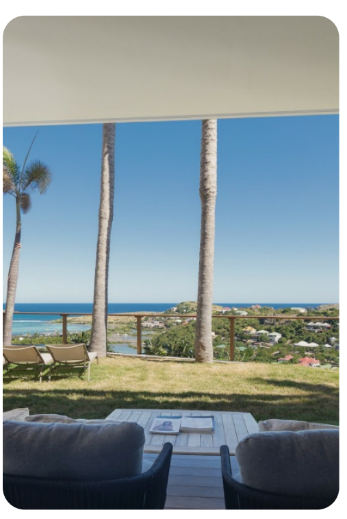
Villa Casa Pablo | Page 6 of 8