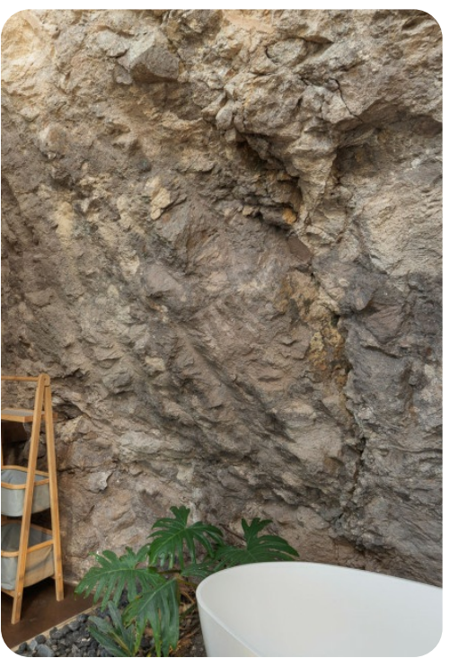
Villa Casa Pablo | Page 5 of 8