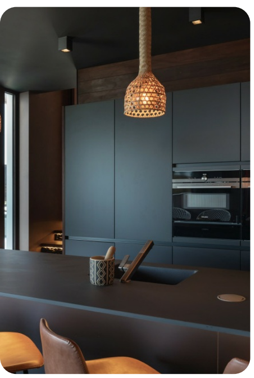
Villa Casa Pablo | Page 3 of 8