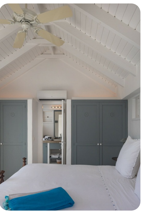
Villa Caramba | Page 4 of 8