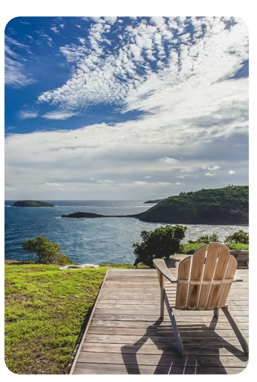
Villa Caramba | Page 7 of 8