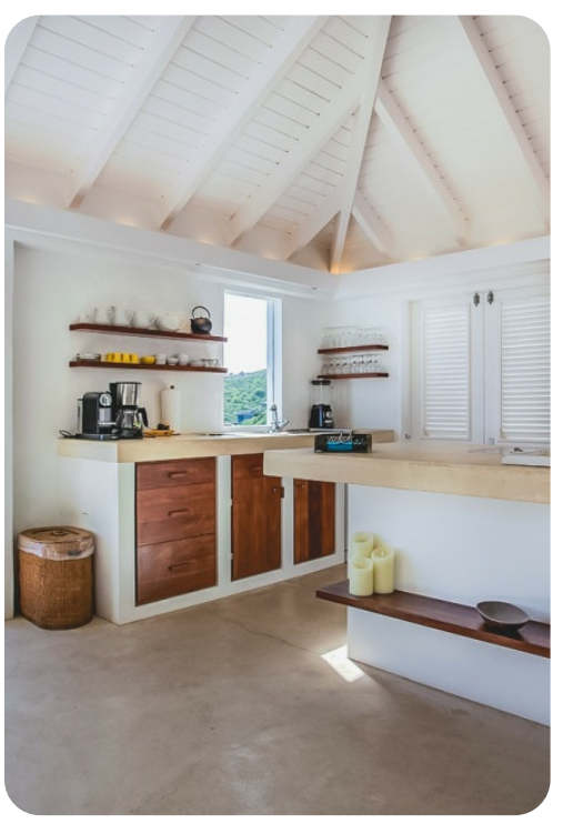
Villa Caramba | Page 3 of 8