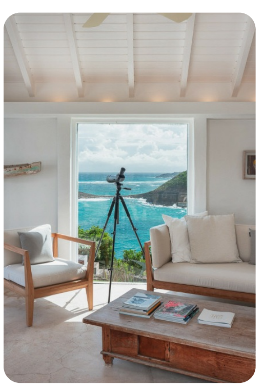
Villa Caramba | Page 8 of 8