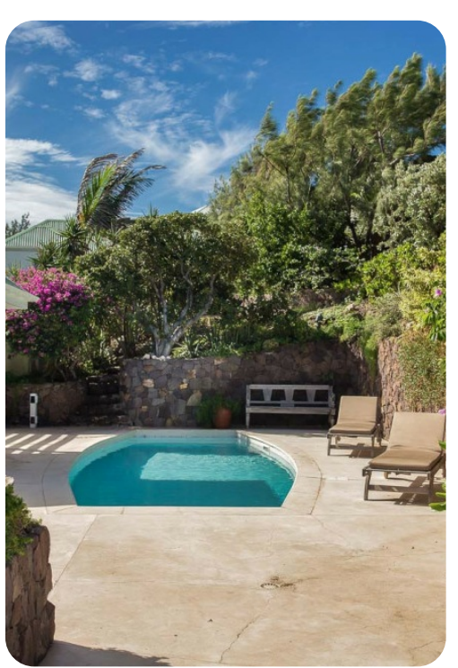
Villa Caramba | Page 6 of 8