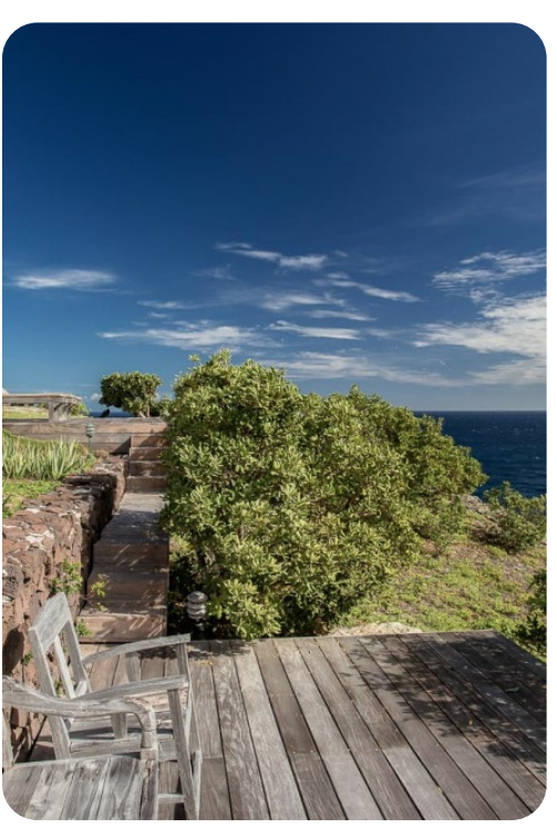
Villa Caramba | Page 5 of 8