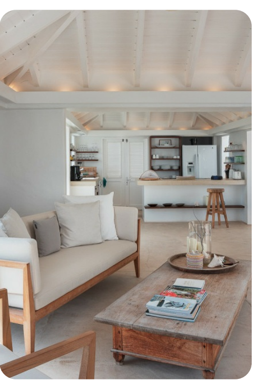
Villa Caramba | Page 2 of 8