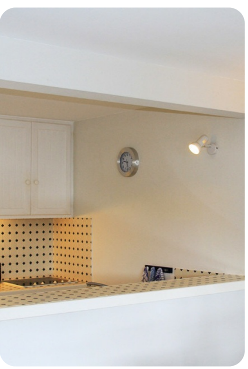
Villa Cap Frehel | Page 2 of 4