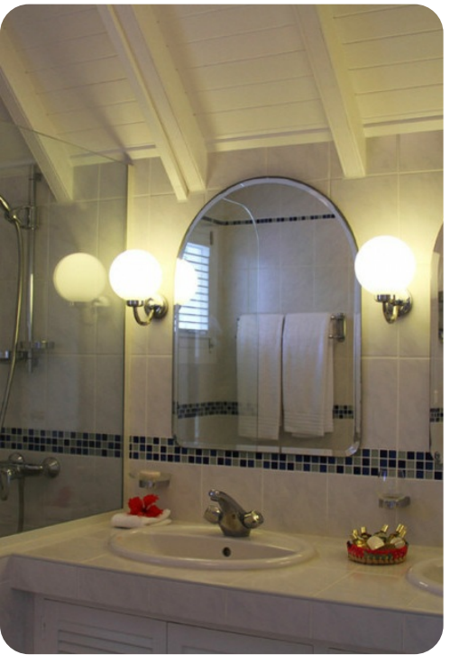
Villa Cap Frehel | Page 3 of 4