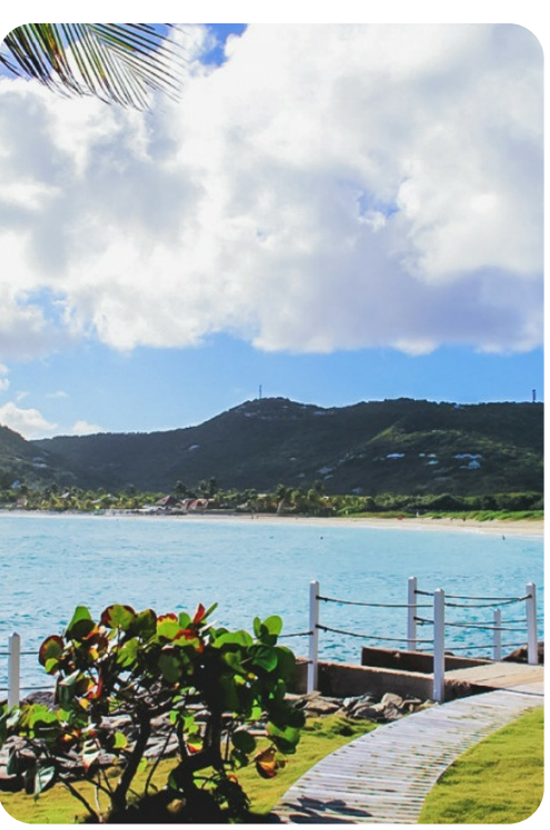
Villa Cap Frehel | Page 4 of 4