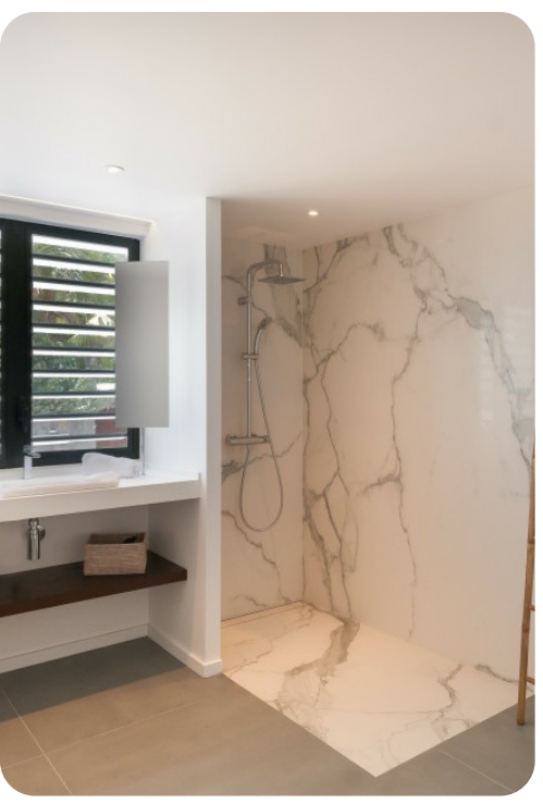
Villa Cairn | Page 4 of 7