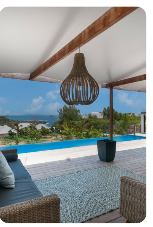
Villa Cairn | Page 6 of 7