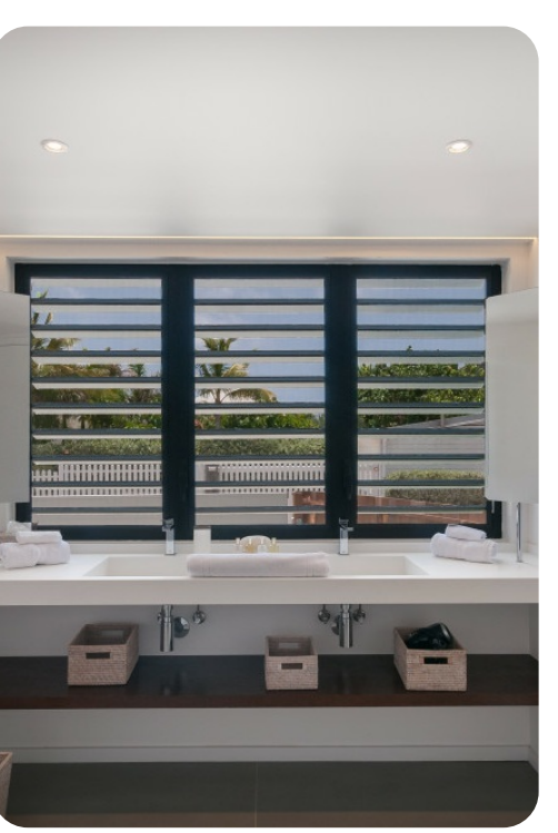
Villa Cairn | Page 3 of 7