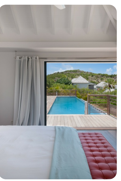
Villa Cairn | Page 5 of 7