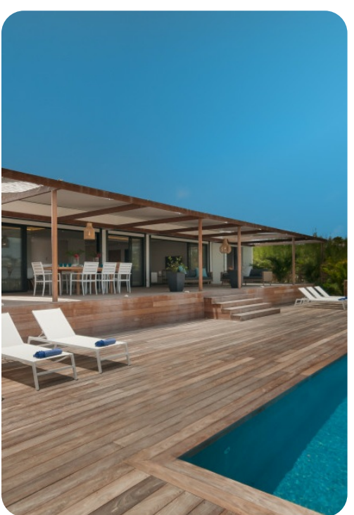
Villa Cairn | Page 7 of 7