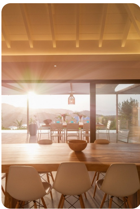
Villa Cairn | Page 2 of 7