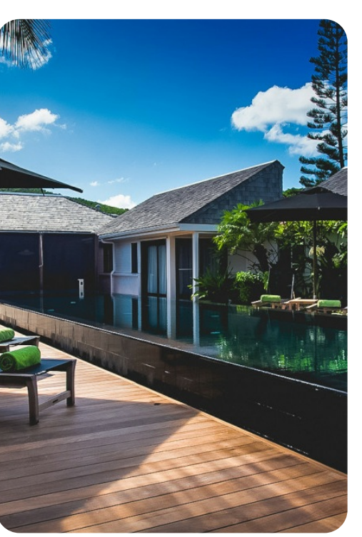
Villa BOM | Page 6 of 8