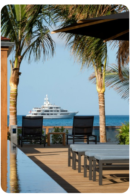
Villa BOM | Page 7 of 8