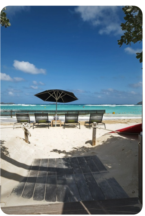
Villa BOM | Page 8 of 8