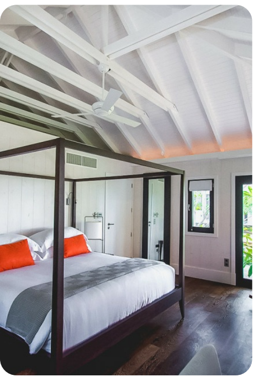
Villa BOM | Page 5 of 8