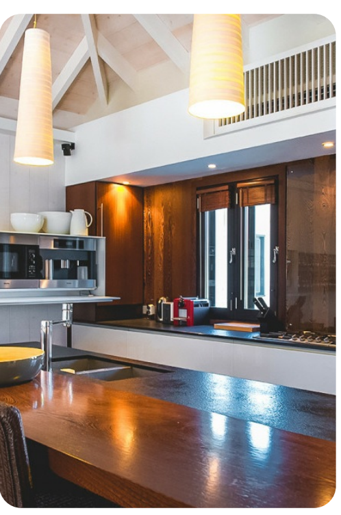
Villa BOM | Page 2 of 8