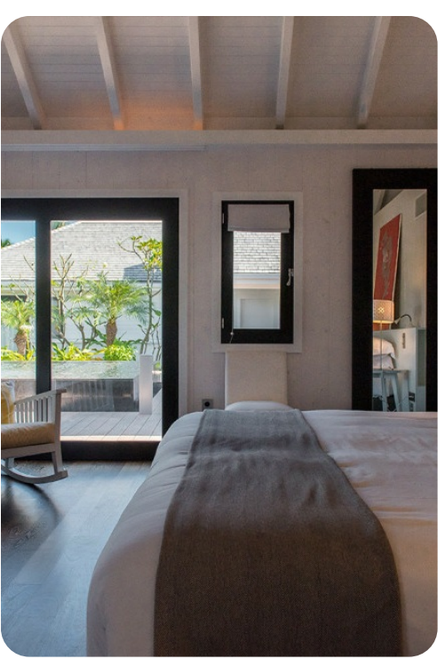
Villa BOM | Page 4 of 8