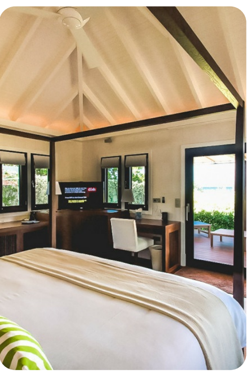
Villa BOM | Page 3 of 8