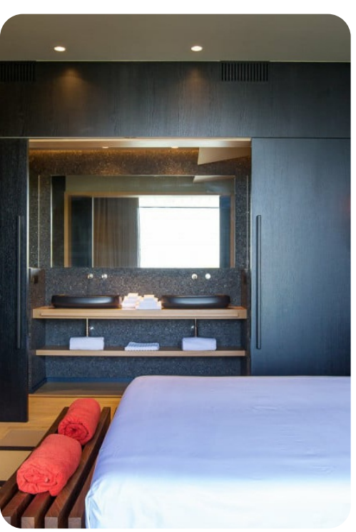
Villa Blackstone | Page 8 of 8