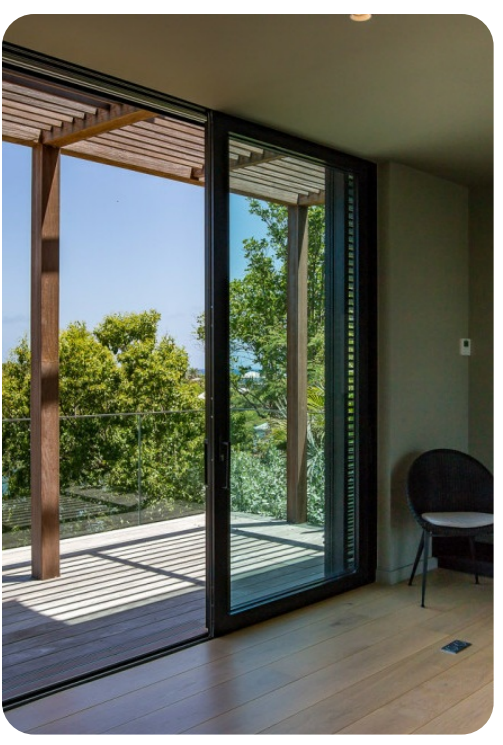
Villa Blackstone | Page 4 of 8