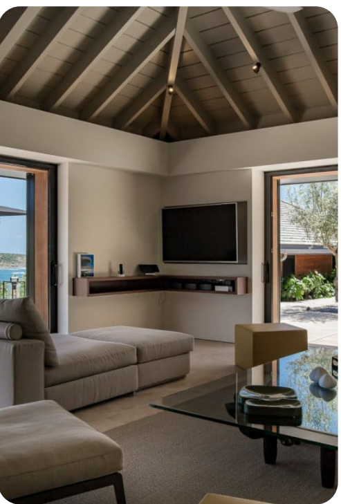
Villa Blackstone | Page 2 of 8