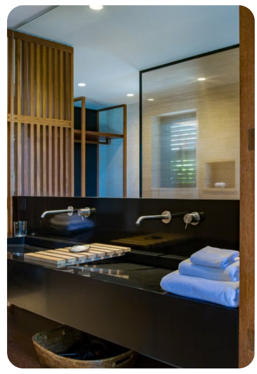
Villa Blackstone | Page 5 of 8