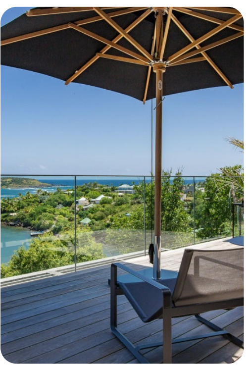
Villa Blackstone | Page 6 of 8