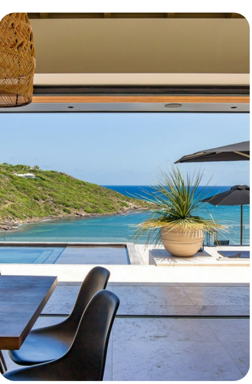
Villa Blackstone | Page 3 of 8