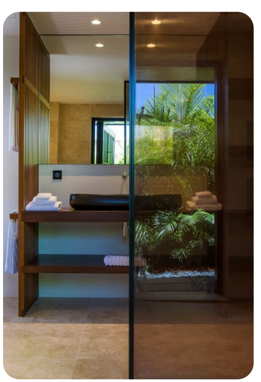
Villa Blackstone | Page 7 of 8