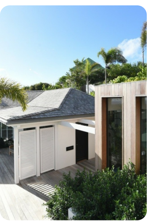
Villa Belle Etoile | Page 4 of 8