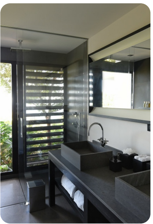
Villa Belle Etoile | Page 6 of 8