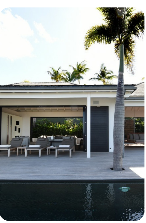
Villa Belle Etoile | Page 7 of 8