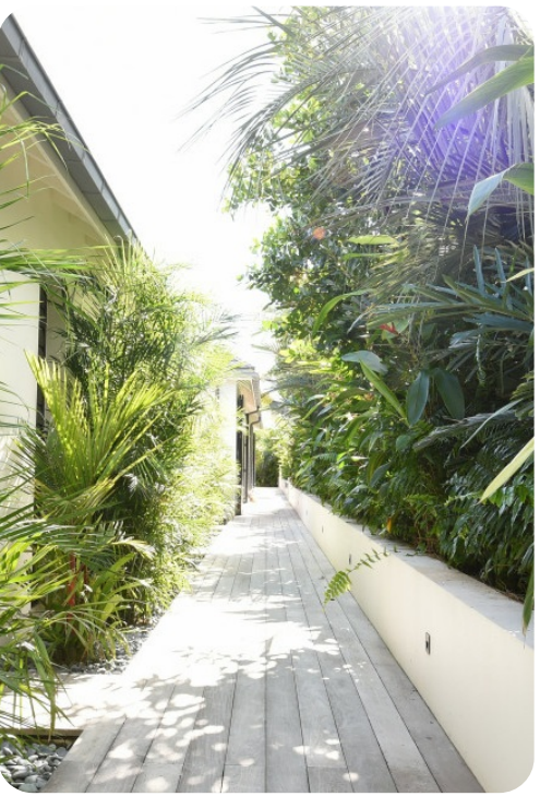
Villa Belle Etoile | Page 8 of 8