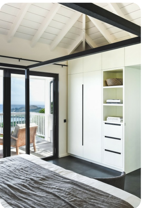
Villa Belle Etoile | Page 5 of 8