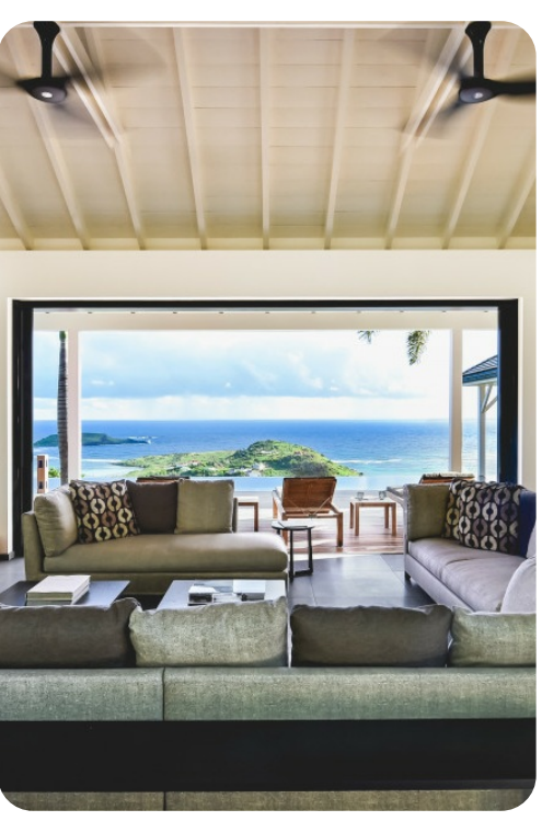
Villa Belle Etoile | Page 2 of 8