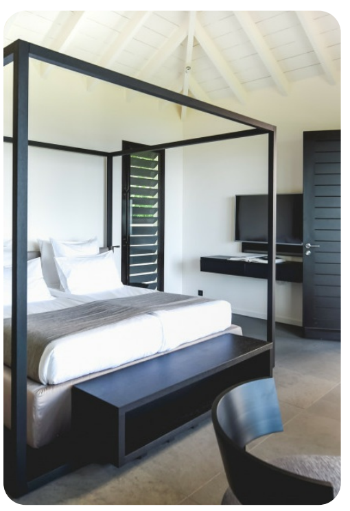
Villa Belle Etoile | Page 3 of 8