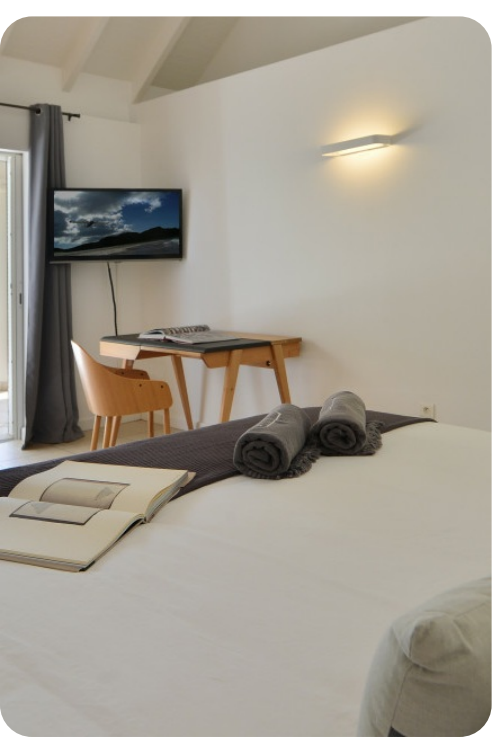
Villa Bel Ombre | Page 5 of 7