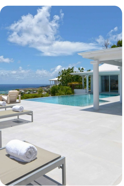
Villa Bel Ombre | Page 6 of 7