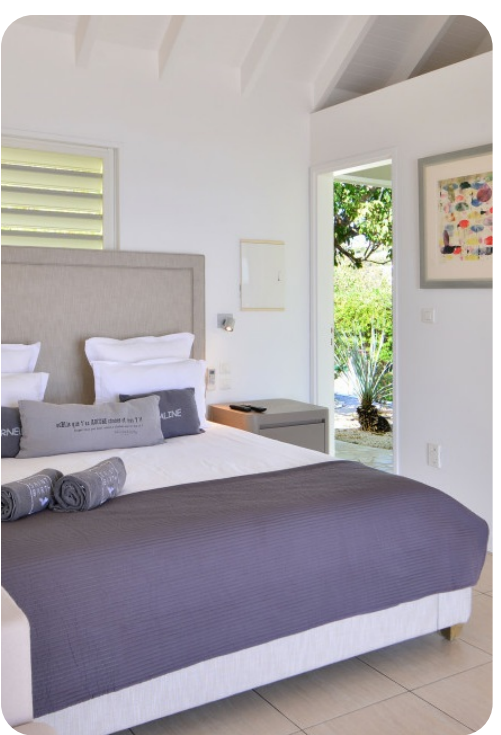
Villa Bel Ombre | Page 4 of 7