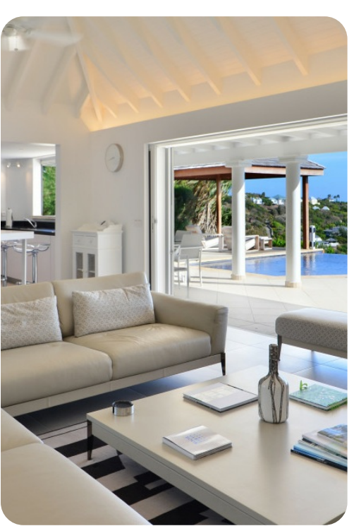
Villa Bel Ombre | Page 2 of 7