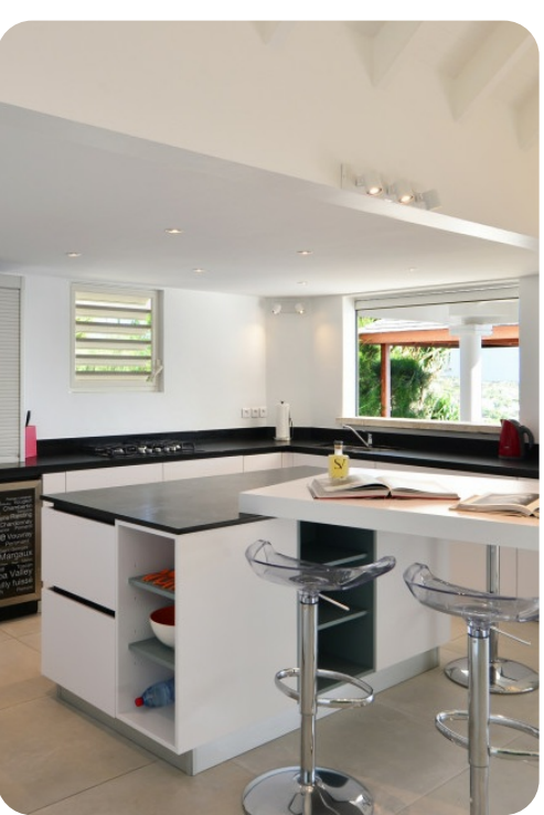
Villa Bel Ombre | Page 3 of 7