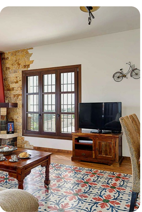
Villa Barranco del Puerto | Page 2 of 4