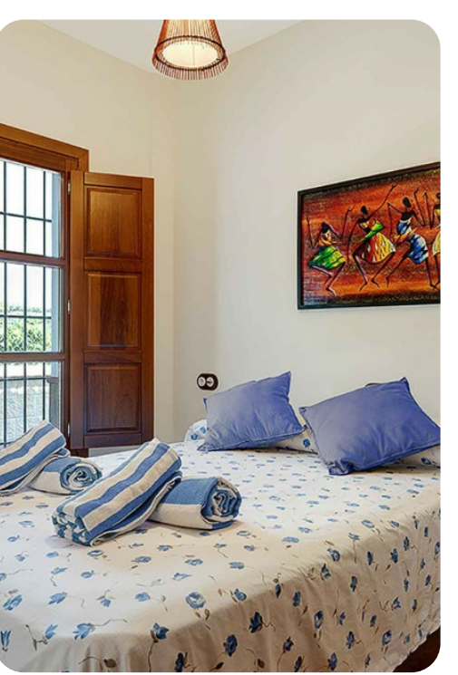
Villa Barranco del Puerto | Page 3 of 4