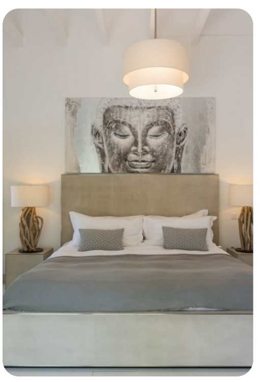
Villa Avalon | Page 3 of 8