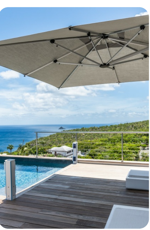
Villa Avalon | Page 7 of 8