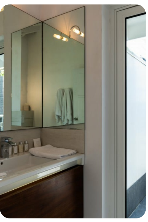
Villa Avalon | Page 4 of 8