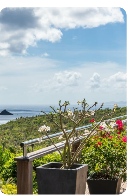
Villa Avalon | Page 6 of 8