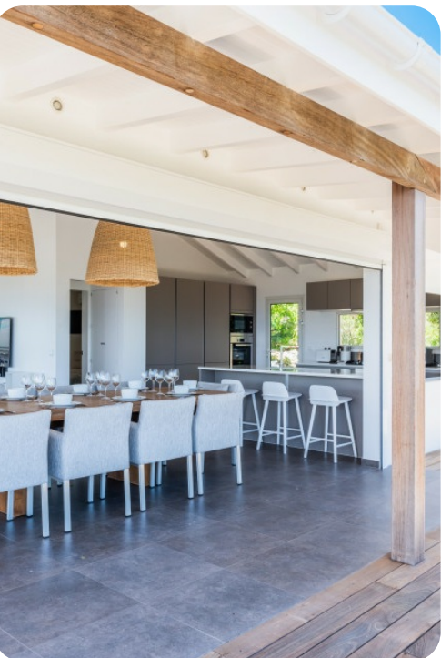
Villa Avalon | Page 2 of 8