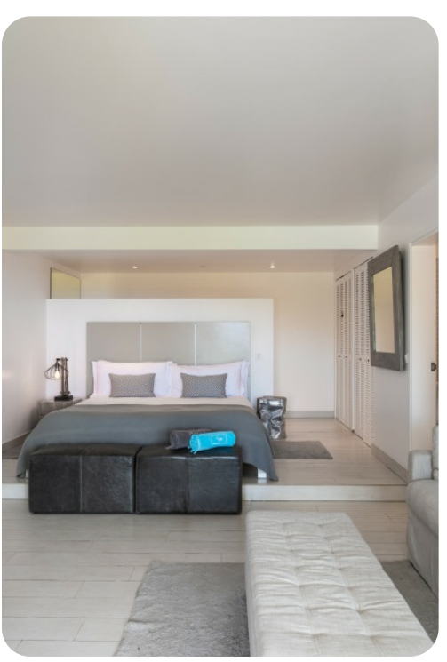
Villa Avalon | Page 5 of 8