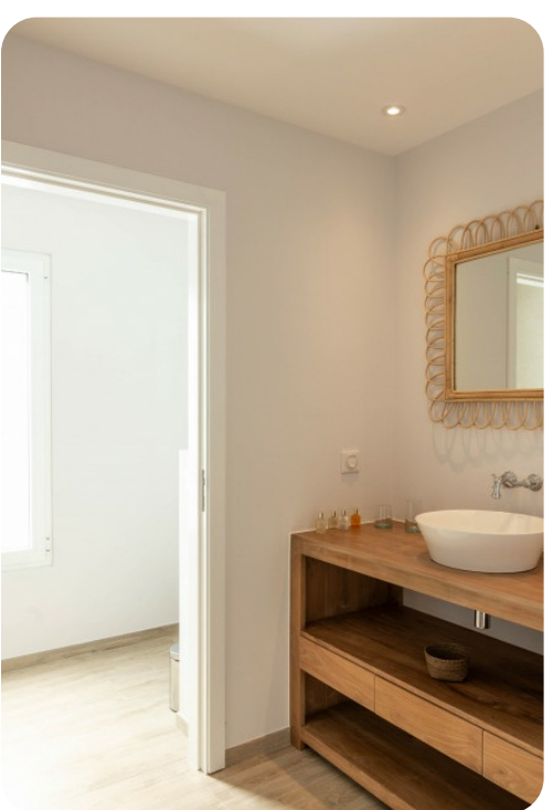
Villa au Paille en Queue | Page 3 of 6