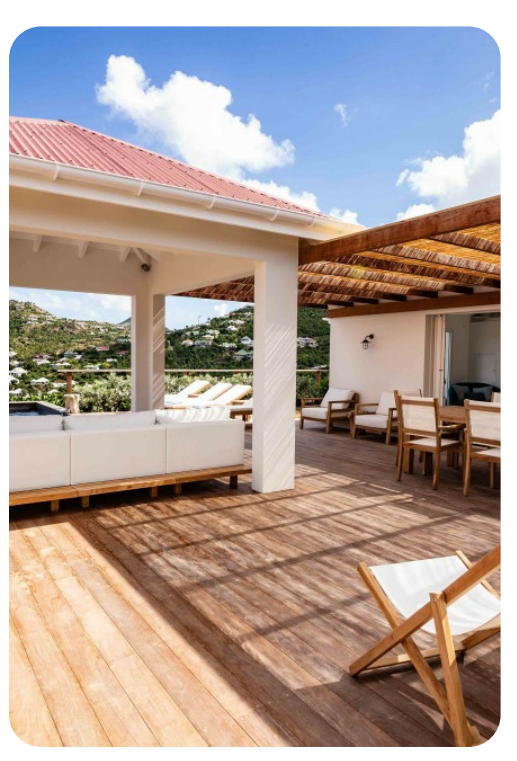
Villa au Paille en Queue | Page 5 of 6