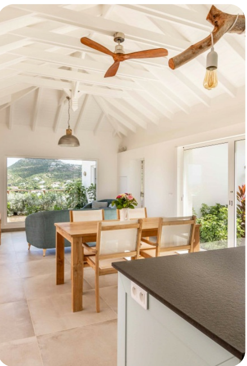
Villa au Paille en Queue | Page 2 of 6