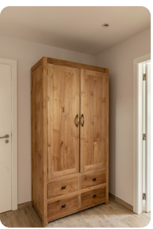
Villa au Paille en Queue | Page 4 of 6