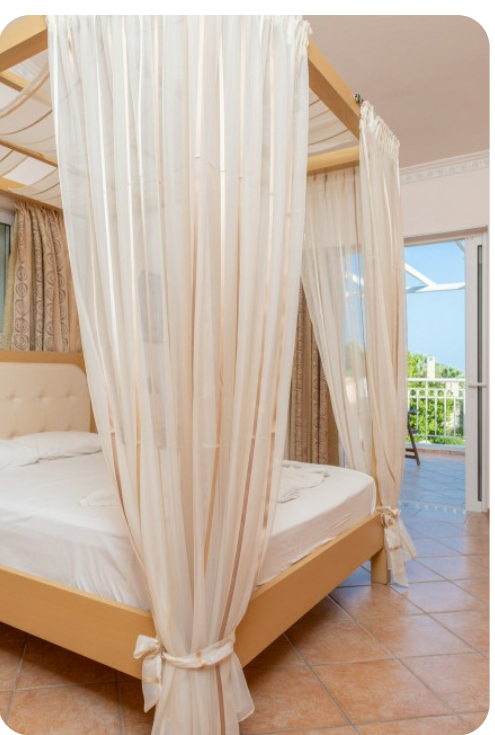
Villa Astro | Page 4 of 8