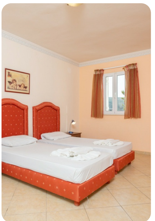
Villa Astro | Page 8 of 8