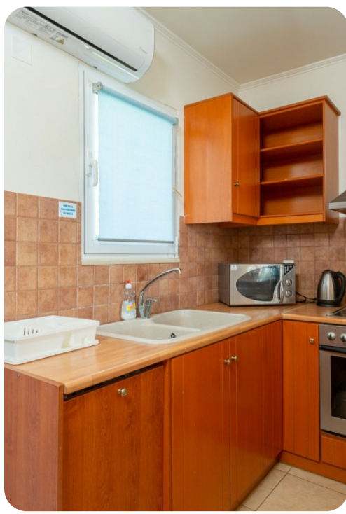
Villa Astro | Page 3 of 8