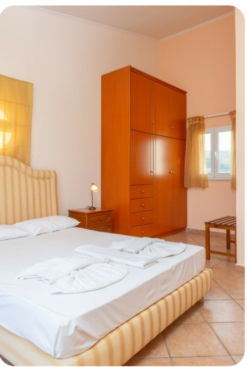
Villa Astro | Page 6 of 8