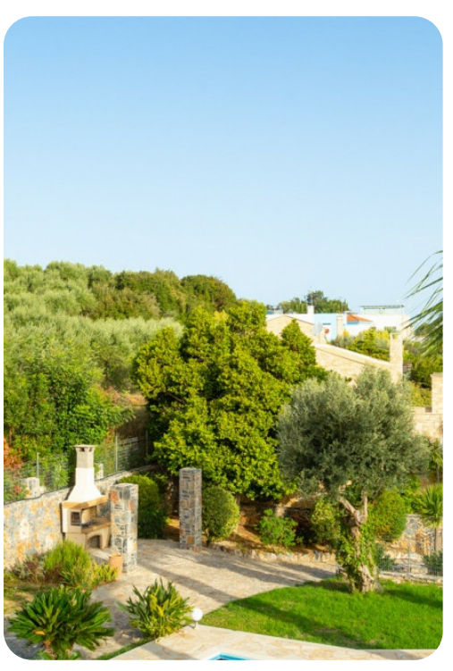
Villa Astro | Page 7 of 8