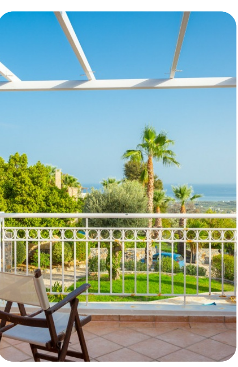
Villa Astro | Page 5 of 8