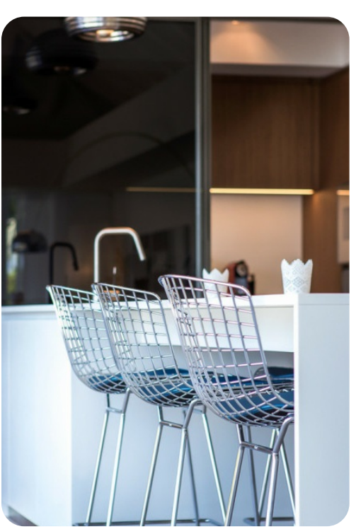
Villa Angelique | Page 3 of 8