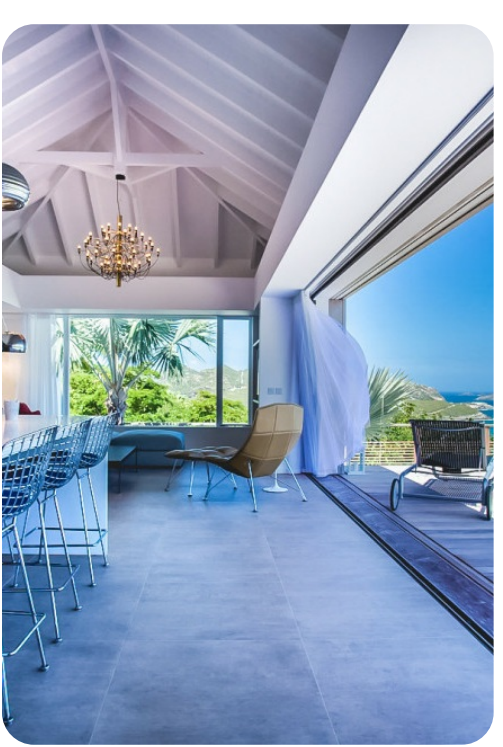
Villa Angelique | Page 2 of 8