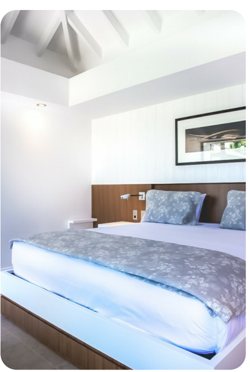
Villa Angelique | Page 4 of 8