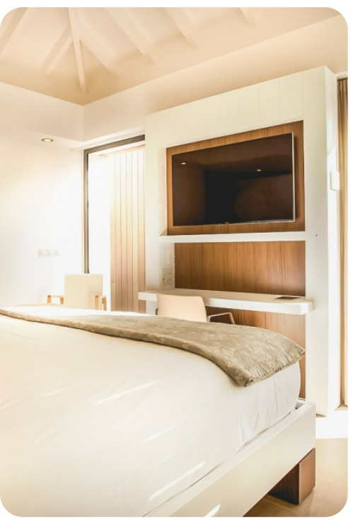
Villa Angelique | Page 7 of 8