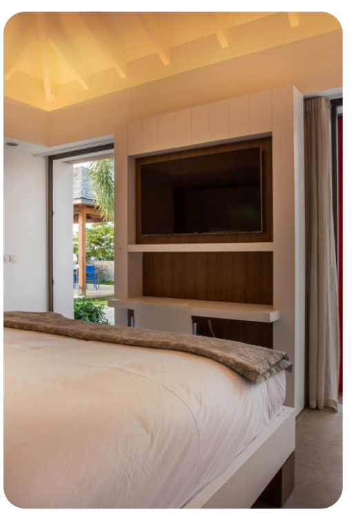
Villa Angelique | Page 6 of 8