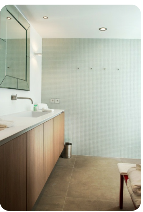
Villa Angelique | Page 5 of 8