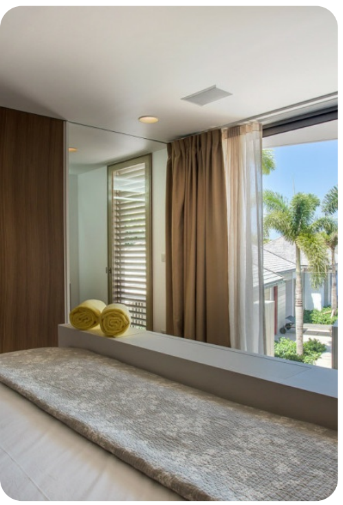
Villa Angelique | Page 8 of 8