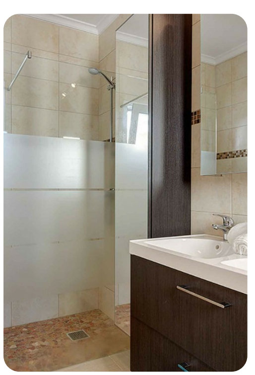
Villa Amancay | Page 6 of 6