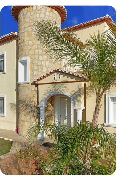
Villa Amancay | Page 3 of 6