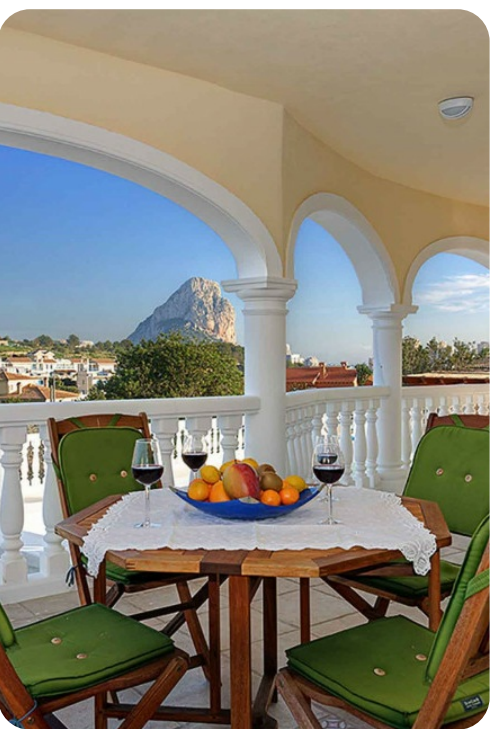
Villa Amancay | Page 2 of 6