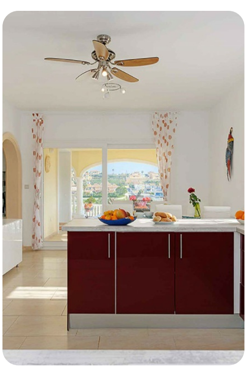
Villa Amancay | Page 4 of 6