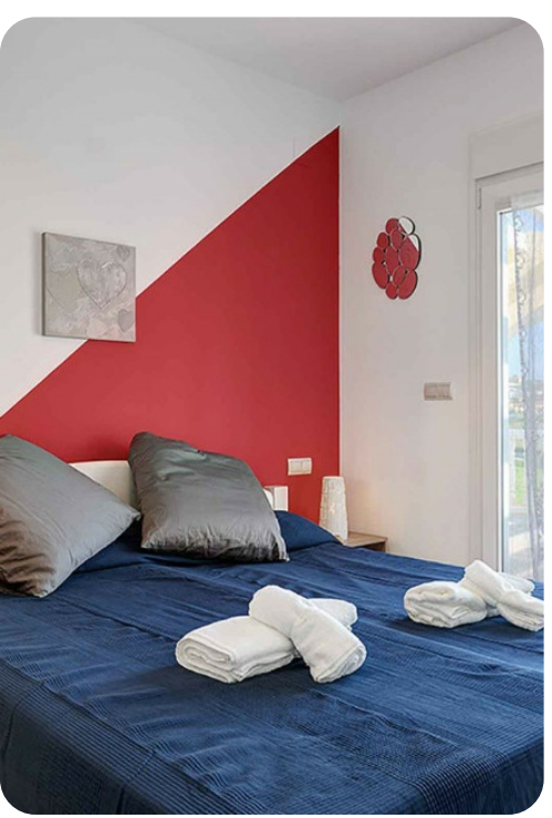
Villa Amancay | Page 5 of 6