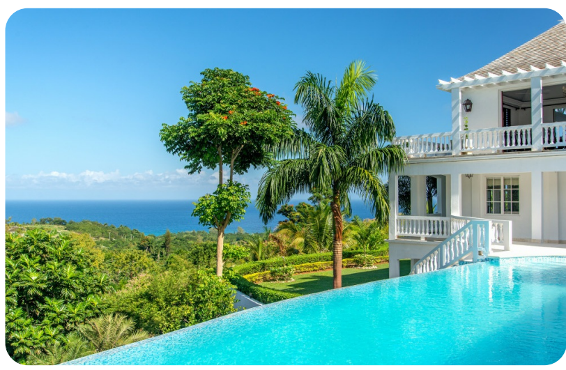
Villa Amana at the Tryall Club | Page 1 of 7