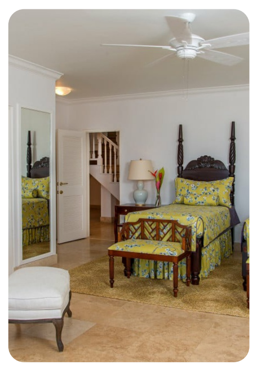
Villa Amana at the Tryall Club | Page 3 of 7