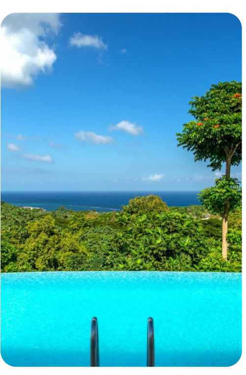
Villa Amana at the Tryall Club | Page 6 of 7