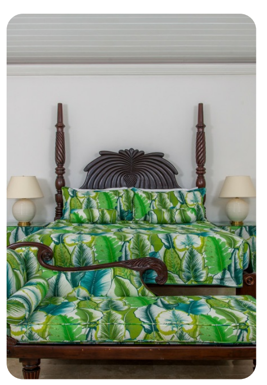
Villa Amana at the Tryall Club | Page 4 of 7