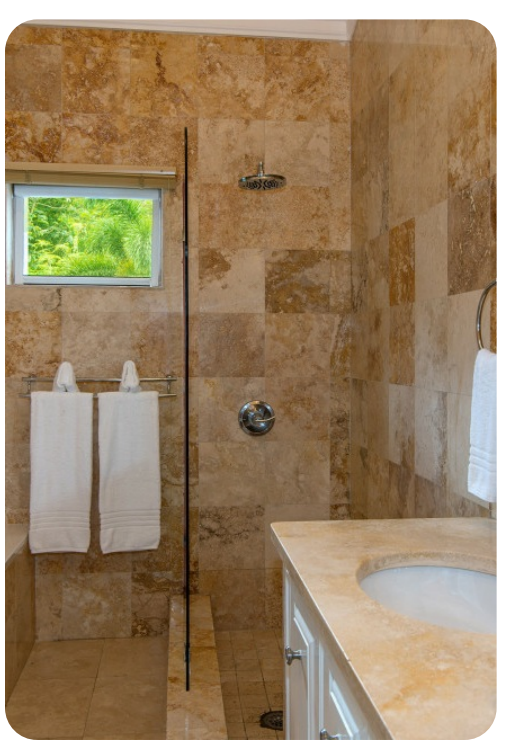
Villa Amana at the Tryall Club | Page 5 of 7