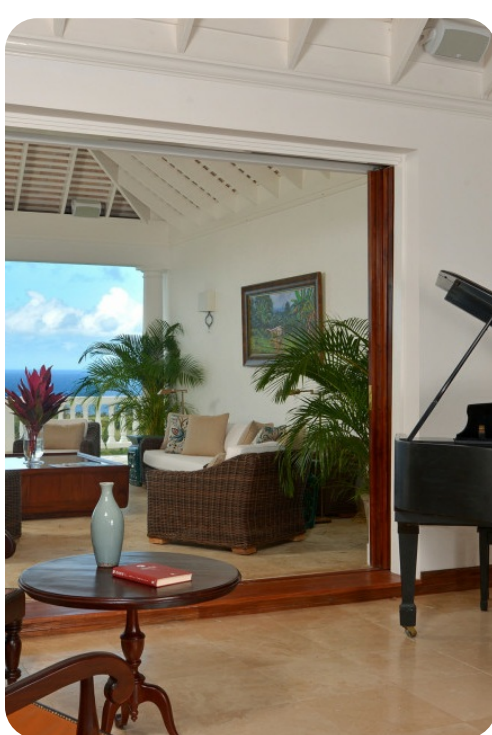
Villa Amana at the Tryall Club | Page 2 of 7