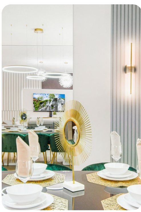
Veranda Palms 114 | Page 2 of 8