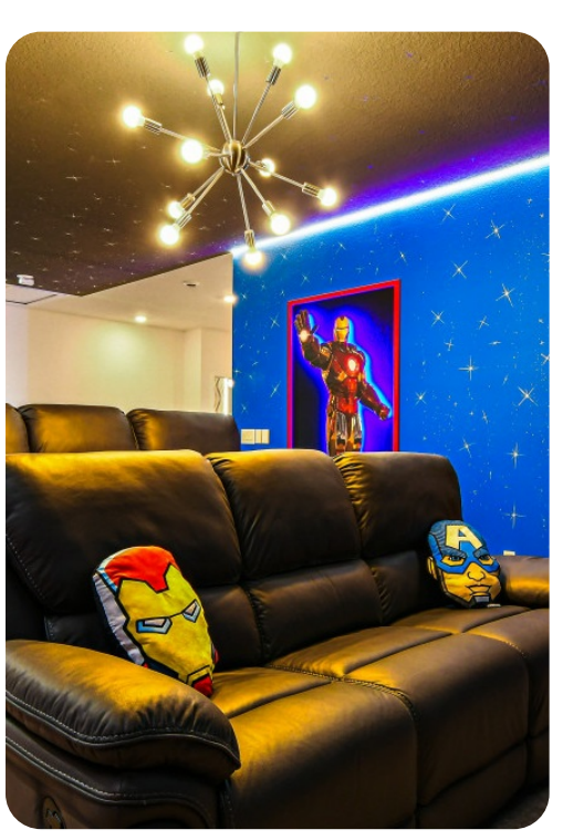
Veranda Palms 114 | Page 3 of 8