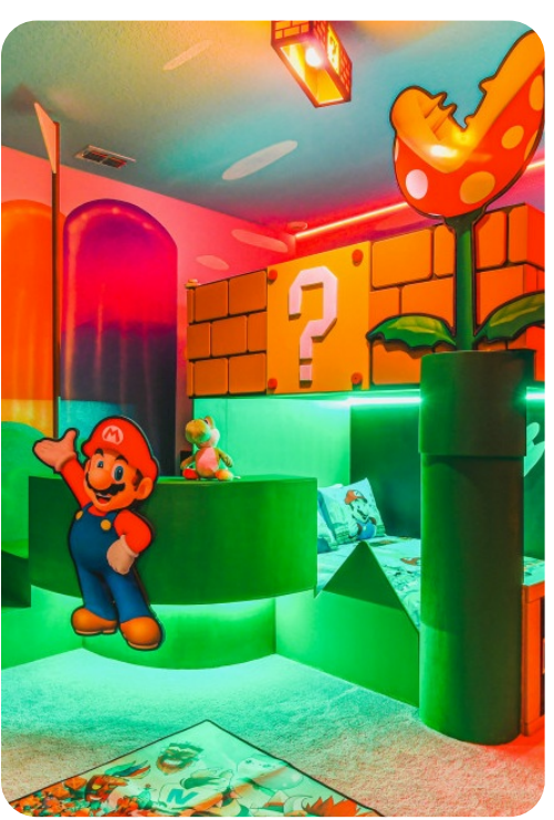
Veranda Palms 114 | Page 8 of 8