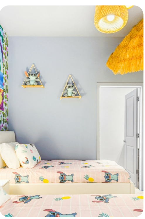
Veranda Palms 114 | Page 5 of 8