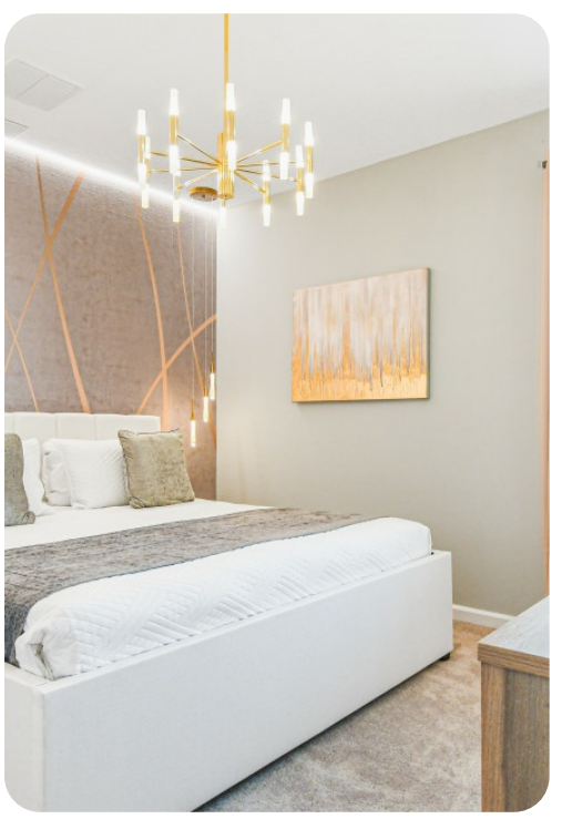
Veranda Palms 114 | Page 7 of 8