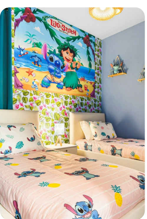
Veranda Palms 114 | Page 4 of 8