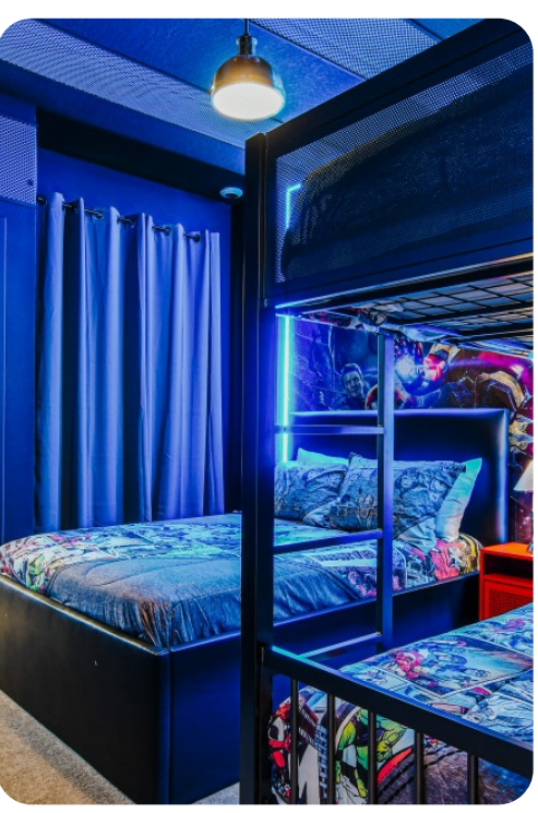
Veranda Palms 114 | Page 6 of 8