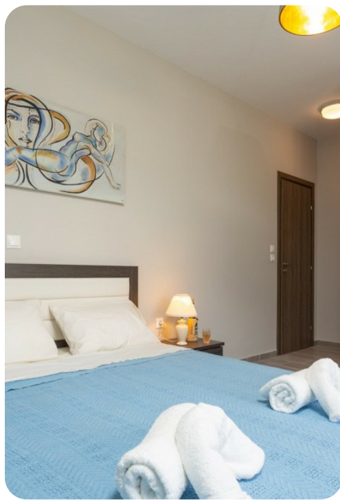
Vatsa Beach Villa | Page 3 of 8