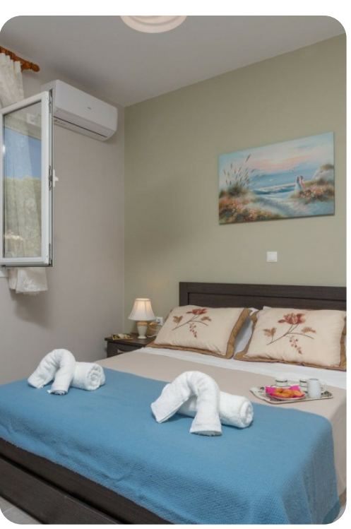
Vatsa Beach Villa | Page 4 of 8