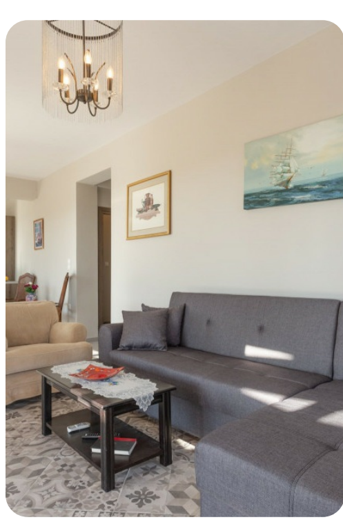
Vatsa Beach Villa | Page 2 of 8