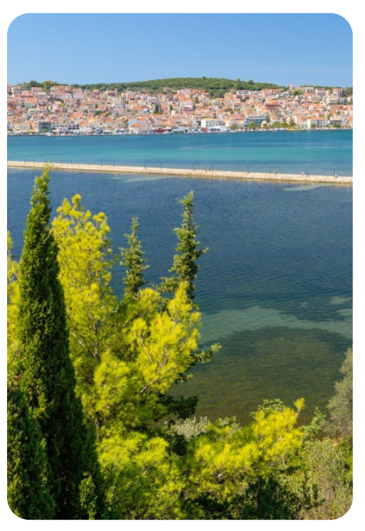
Vatsa Beach Villa | Page 8 of 8