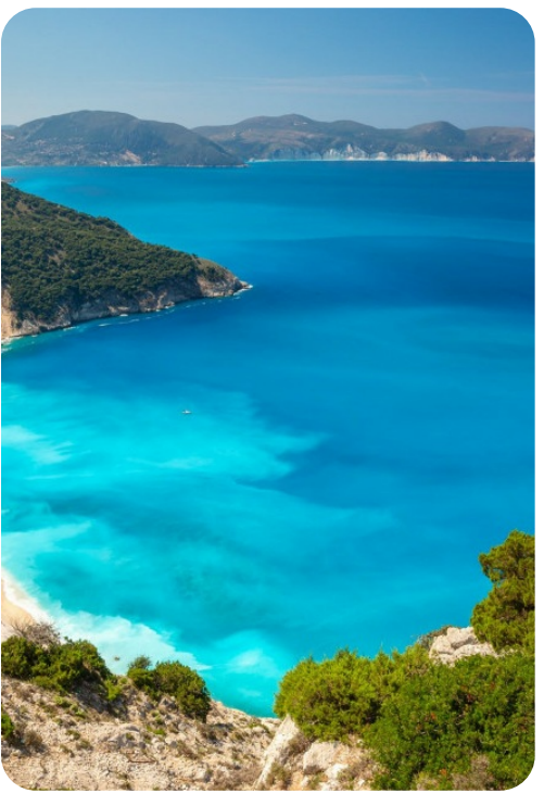
Vatsa Beach Villa | Page 7 of 8