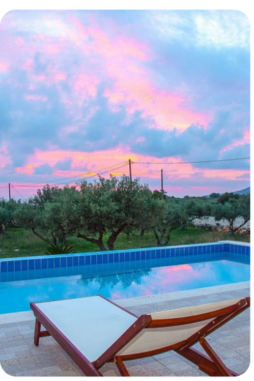
Vatsa Beach Villa | Page 6 of 8