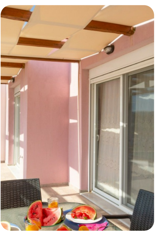
Vatsa Beach Villa | Page 5 of 8