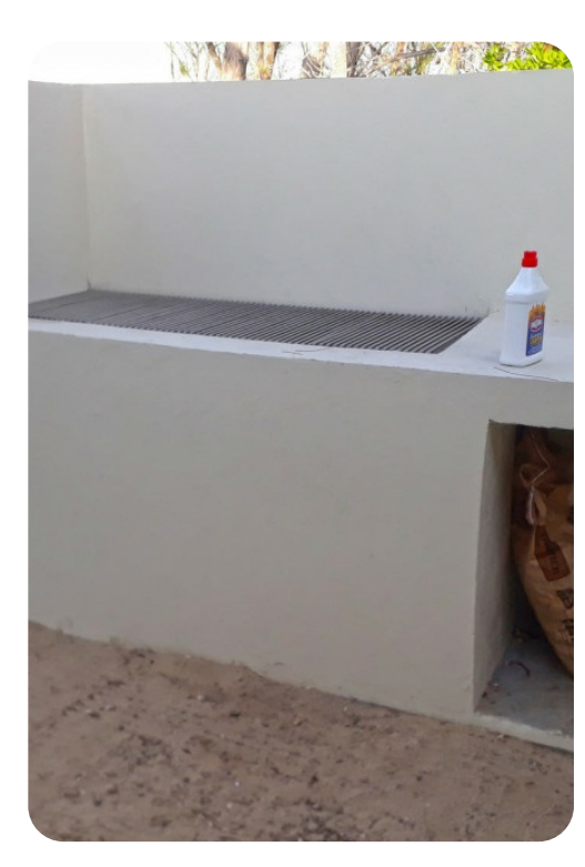
Twin Palms Grand Cayman | Page 8 of 8