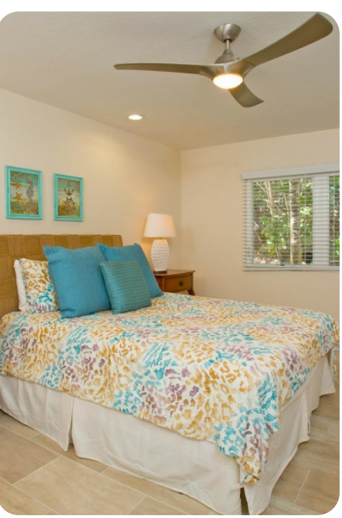
Twin Palms Grand Cayman | Page 5 of 8