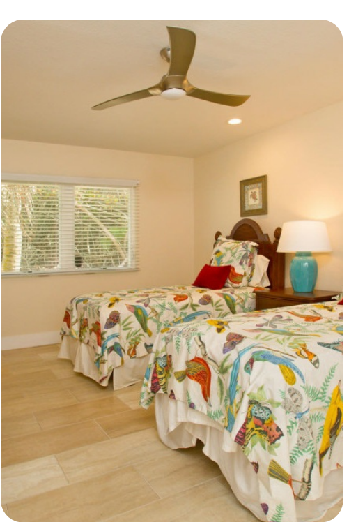
Twin Palms Grand Cayman | Page 4 of 8