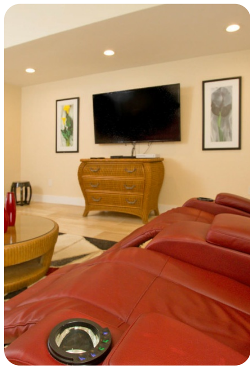
Twin Palms Grand Cayman | Page 3 of 8