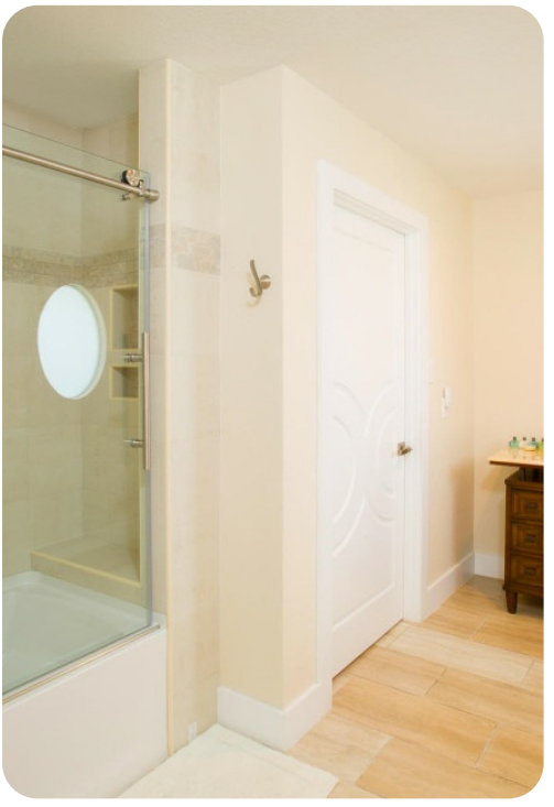
Twin Palms Grand Cayman | Page 6 of 8