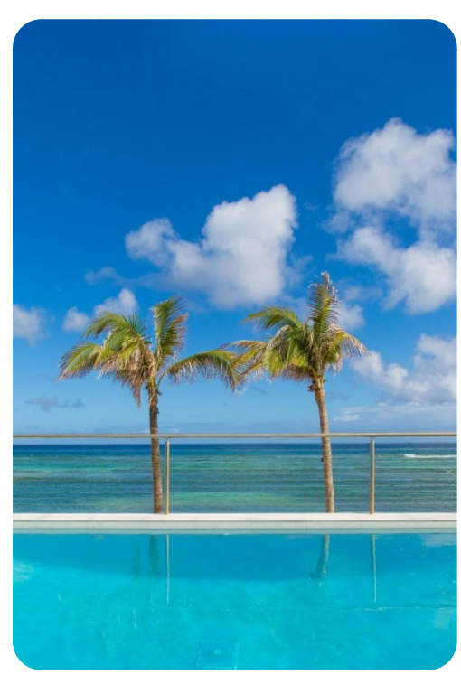
Twin Palms Grand Cayman | Page 7 of 8