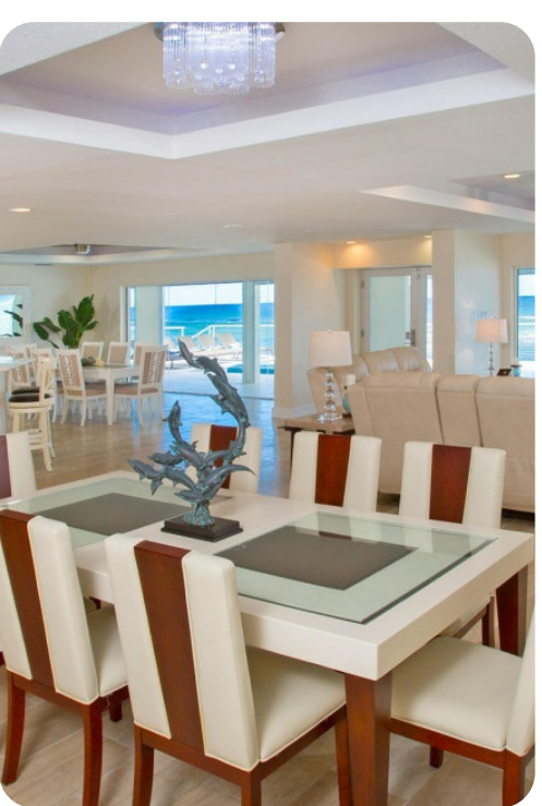
Twin Palms Grand Cayman | Page 2 of 8