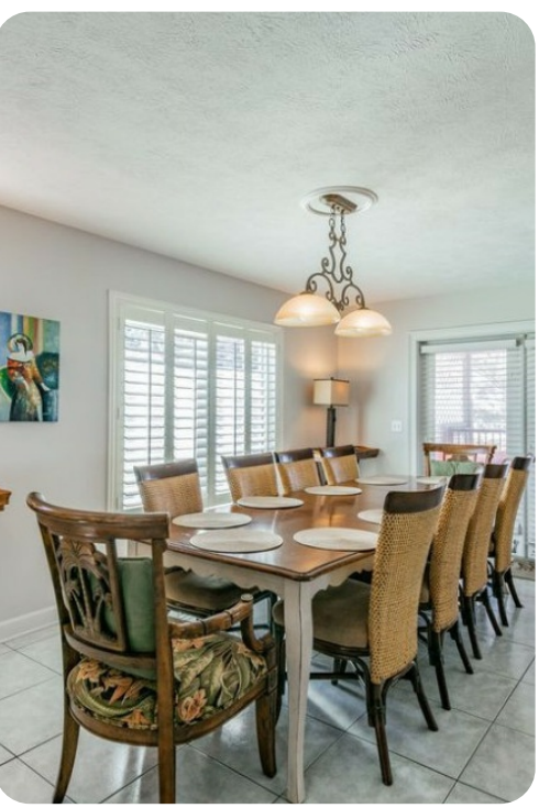
Treasure Island 4 | Page 3 of 8