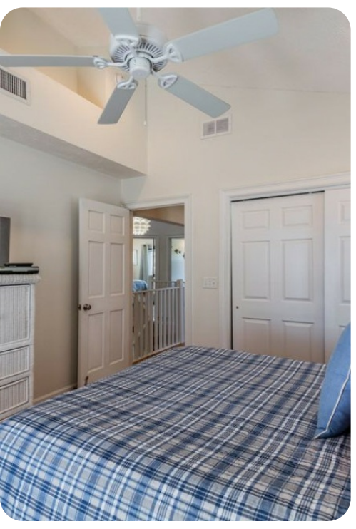
Treasure Island 4 | Page 5 of 8