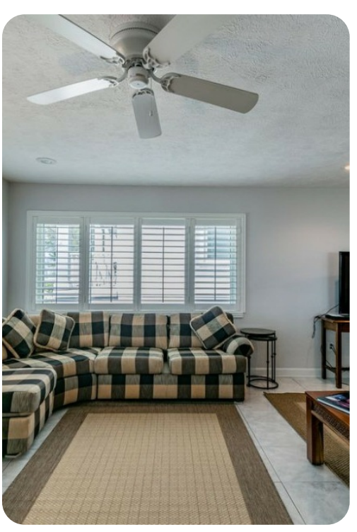
Treasure Island 4 | Page 2 of 8