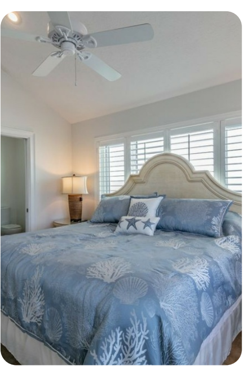
Treasure Island 4 | Page 6 of 8