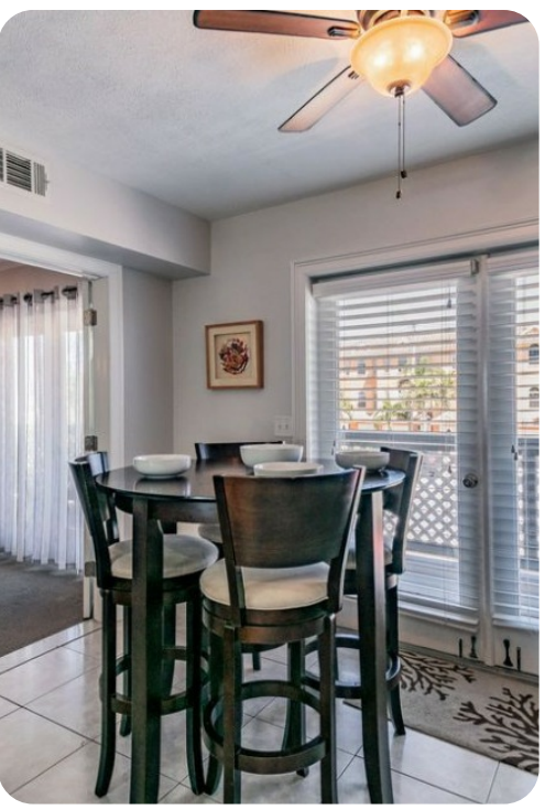
Treasure Island 4 | Page 4 of 8