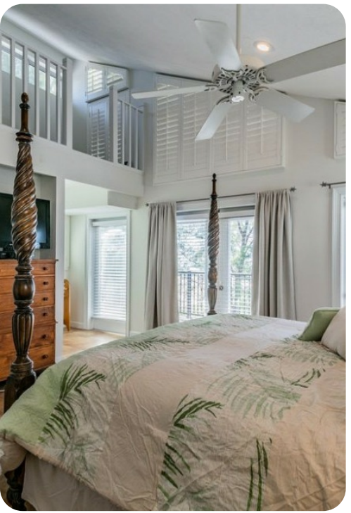
Treasure Island 4 | Page 8 of 8