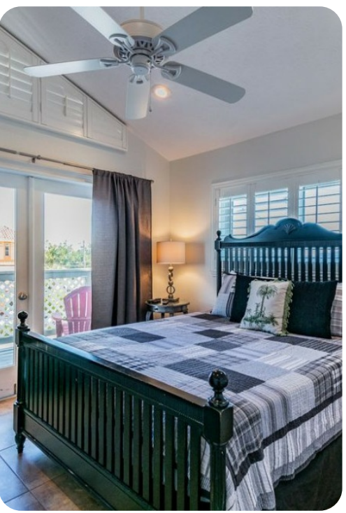
Treasure Island 4 | Page 7 of 8