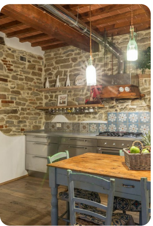
Torre Ginestre | Page 5 of 8