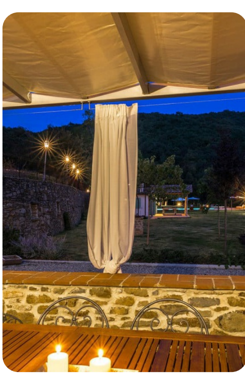
Torre Ginestre | Page 3 of 8