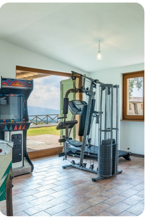
Torre Ginestre | Page 8 of 8