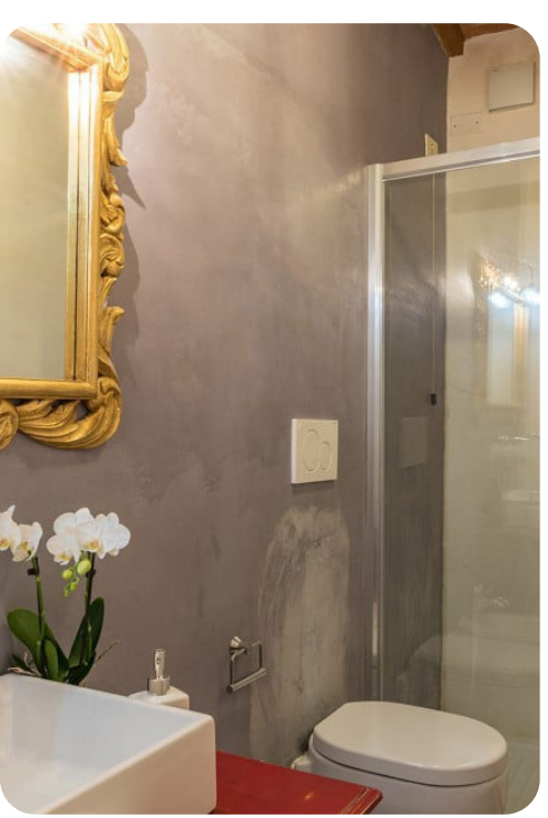
Torre Ginestre | Page 7 of 8