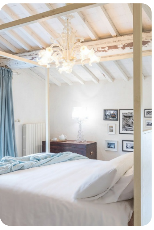
Torre Ginestre | Page 6 of 8