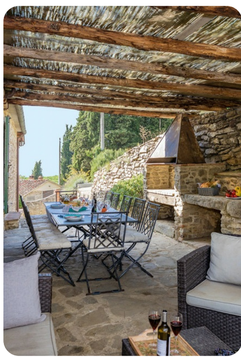
Torre Ginestre | Page 2 of 8