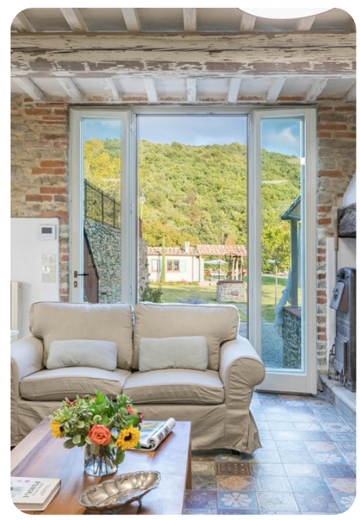
Torre Ginestre | Page 4 of 8