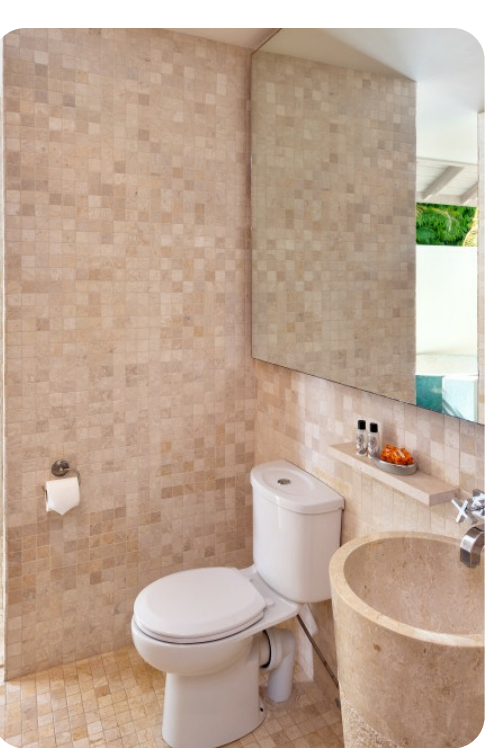
Tom Tom | Page 4 of 7