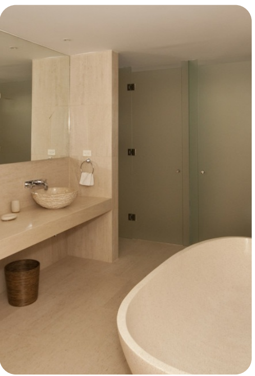
Tom Tom | Page 3 of 7