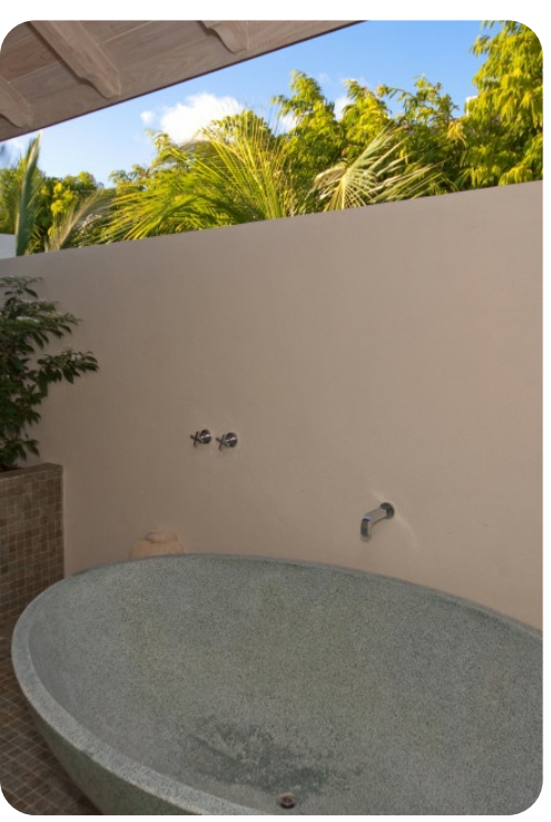
Tom Tom | Page 5 of 7