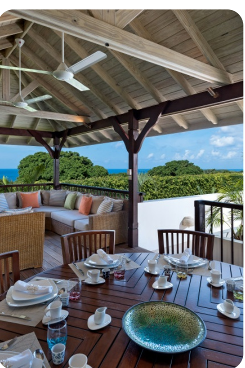
Tom Tom | Page 6 of 7