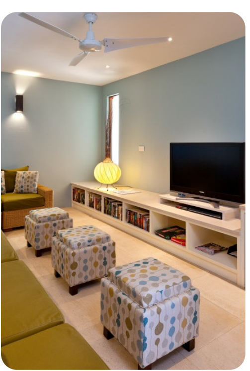
Tom Tom | Page 2 of 7