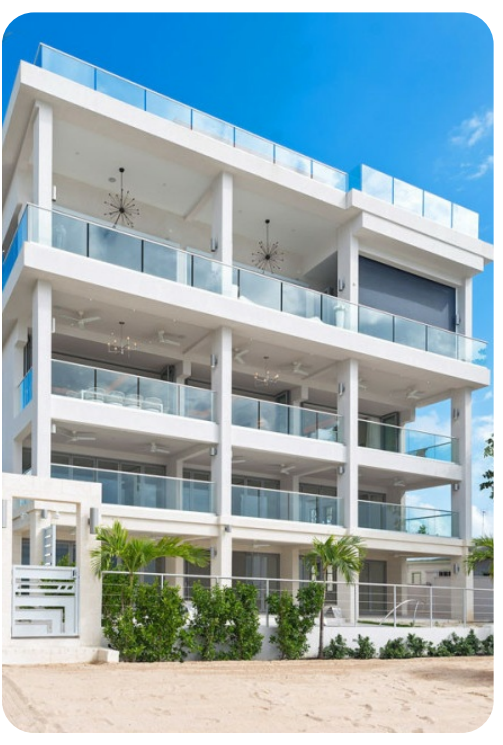
The Villa at The St. James | Page 5 of 6