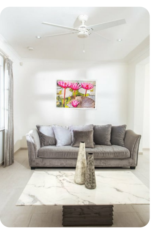
The Villa at The St. James | Page 4 of 6