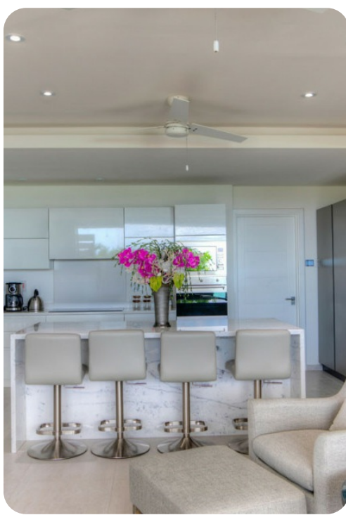
The Villa at The St. James | Page 2 of 6