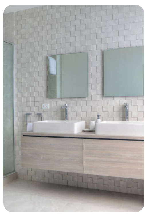
The Villa at The St. James | Page 3 of 6