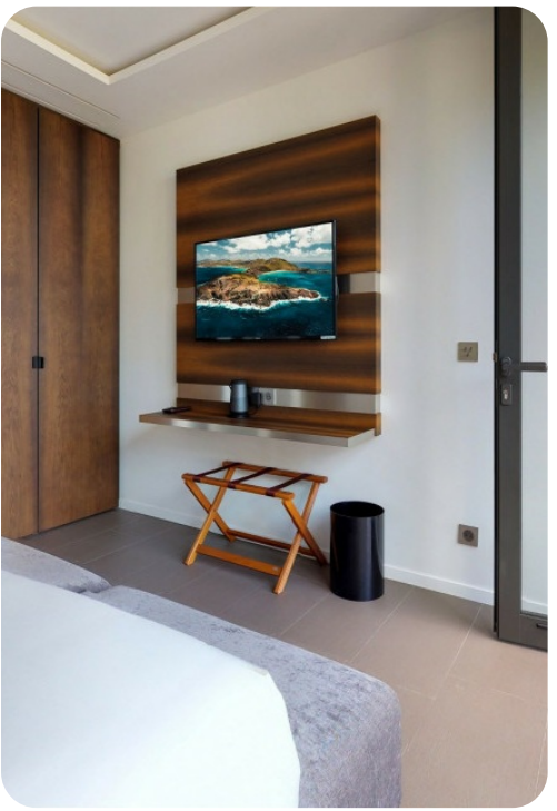
The Source | Page 8 of 8