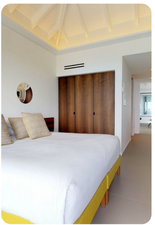
The Source | Page 6 of 8