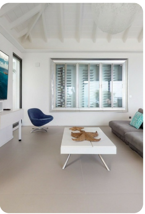
The Source | Page 3 of 8