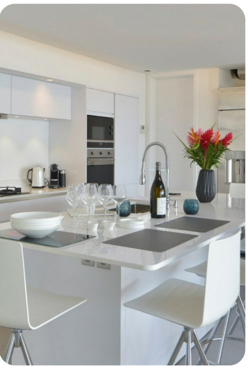
The Source | Page 5 of 8