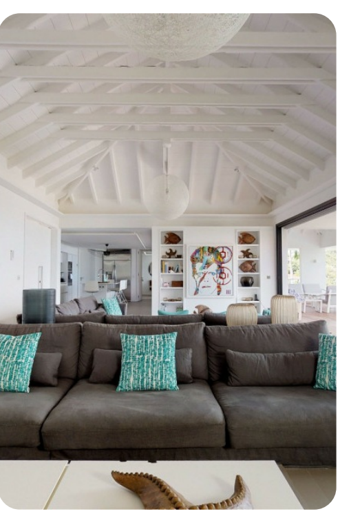
The Source | Page 2 of 8