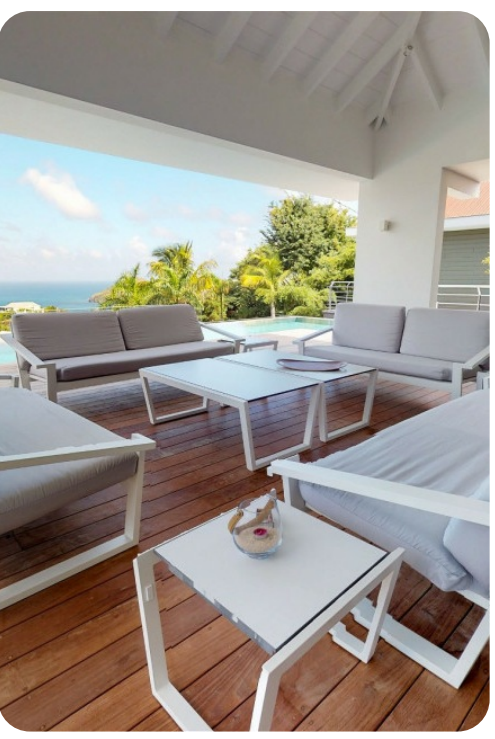
The Source | Page 4 of 8