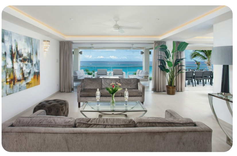
The One at The St. James - 4-bed | Page 1 of 4