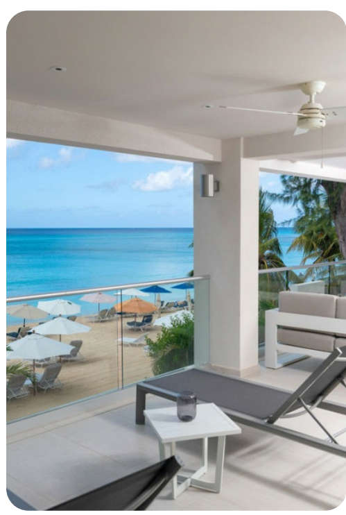
The One at The St. James - 4-bed | Page 2 of 4