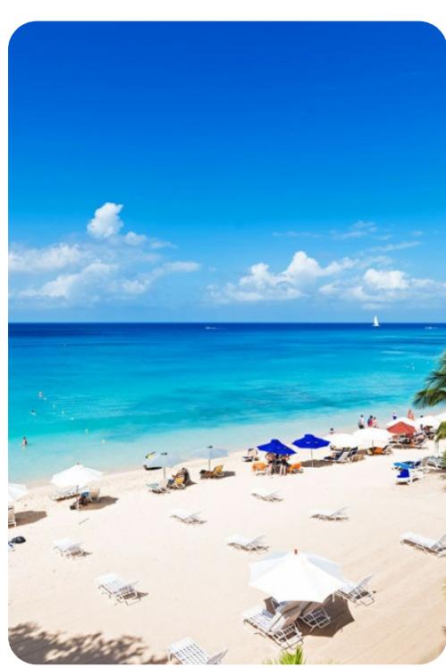
The One at The St. James - 4-bed | Page 3 of 4