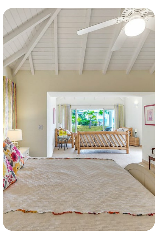
Terrasse de Mer | Page 6 of 8