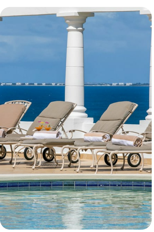
Terrasse de Mer | Page 8 of 8