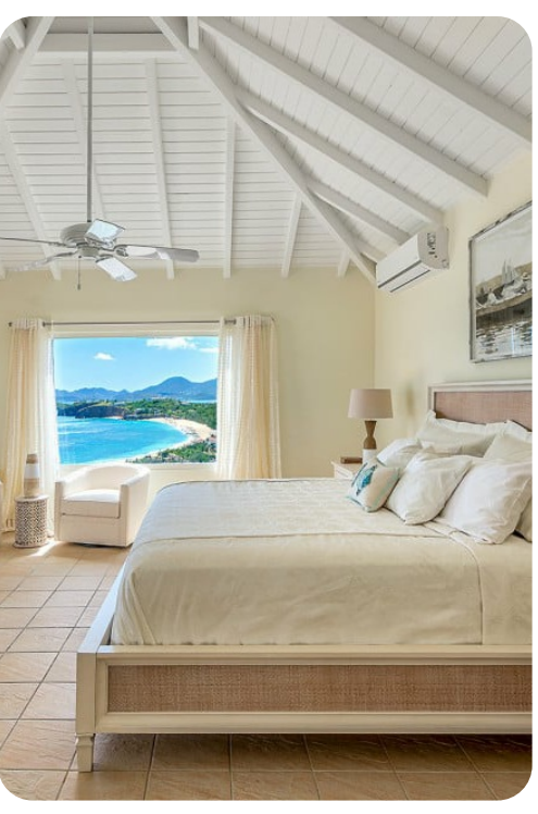
Terrasse de Mer | Page 4 of 8