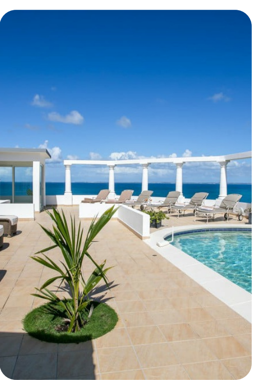
Terrasse de Mer | Page 7 of 8