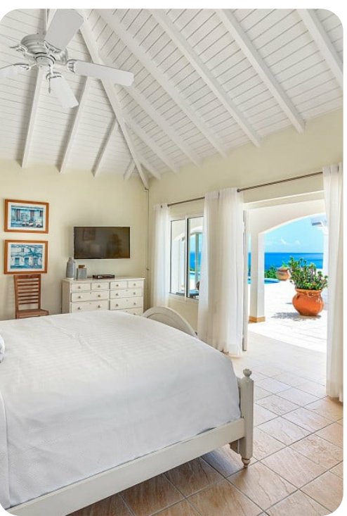
Terrasse de Mer | Page 5 of 8