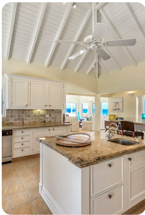
Terrasse de Mer | Page 3 of 8