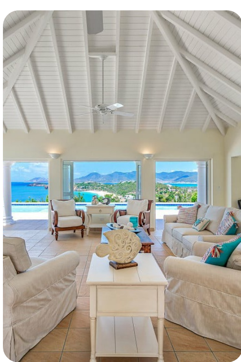
Terrasse de Mer | Page 2 of 8