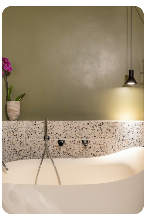
Terra di Siena | Page 7 of 8