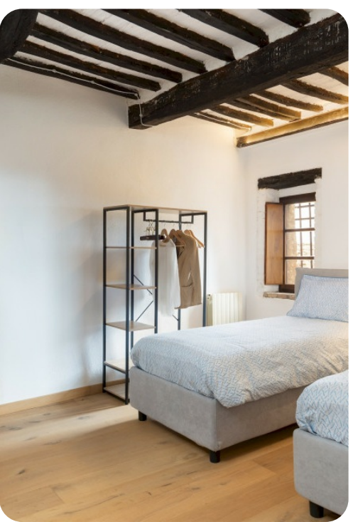
Terra di Siena | Page 5 of 8