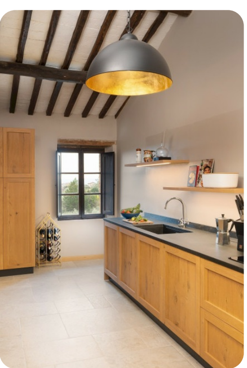
Terra di Siena | Page 2 of 8