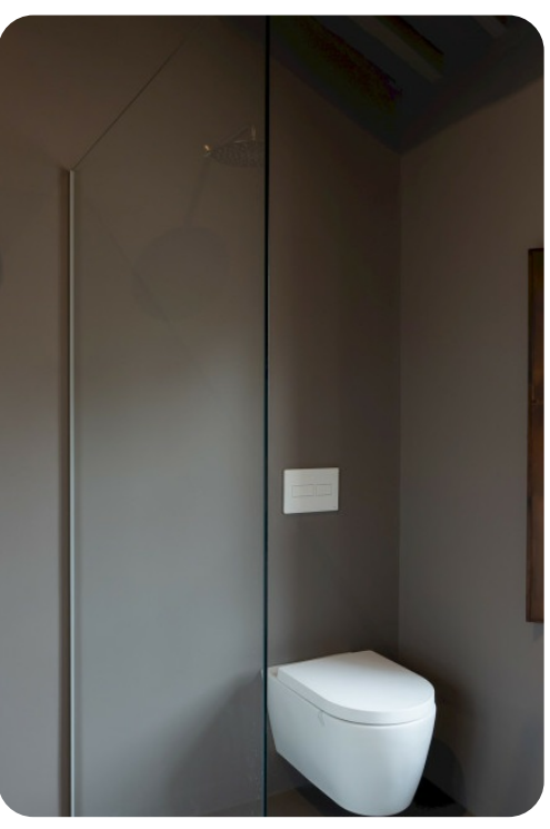
Terra di Siena | Page 8 of 8