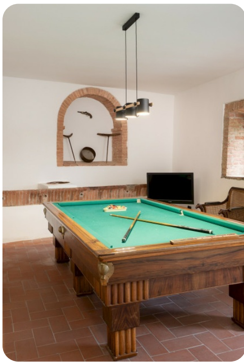
Terra di Siena | Page 3 of 8