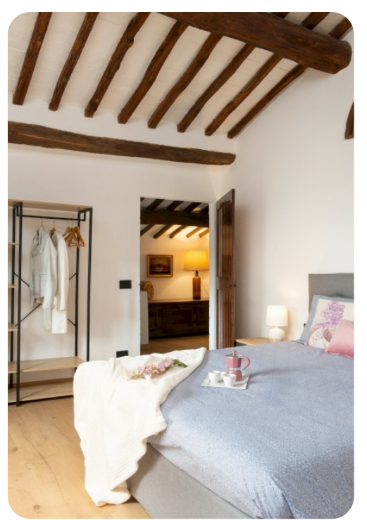
Terra di Siena | Page 4 of 8