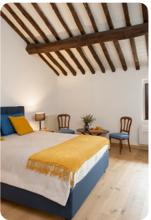
Terra di Siena | Page 6 of 8